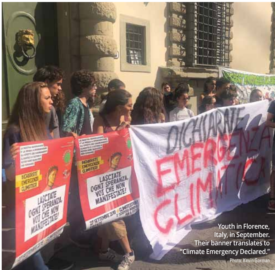
Youth in Florence, Italy, in September. Their banner translates to “Climate Emergency Declared.”