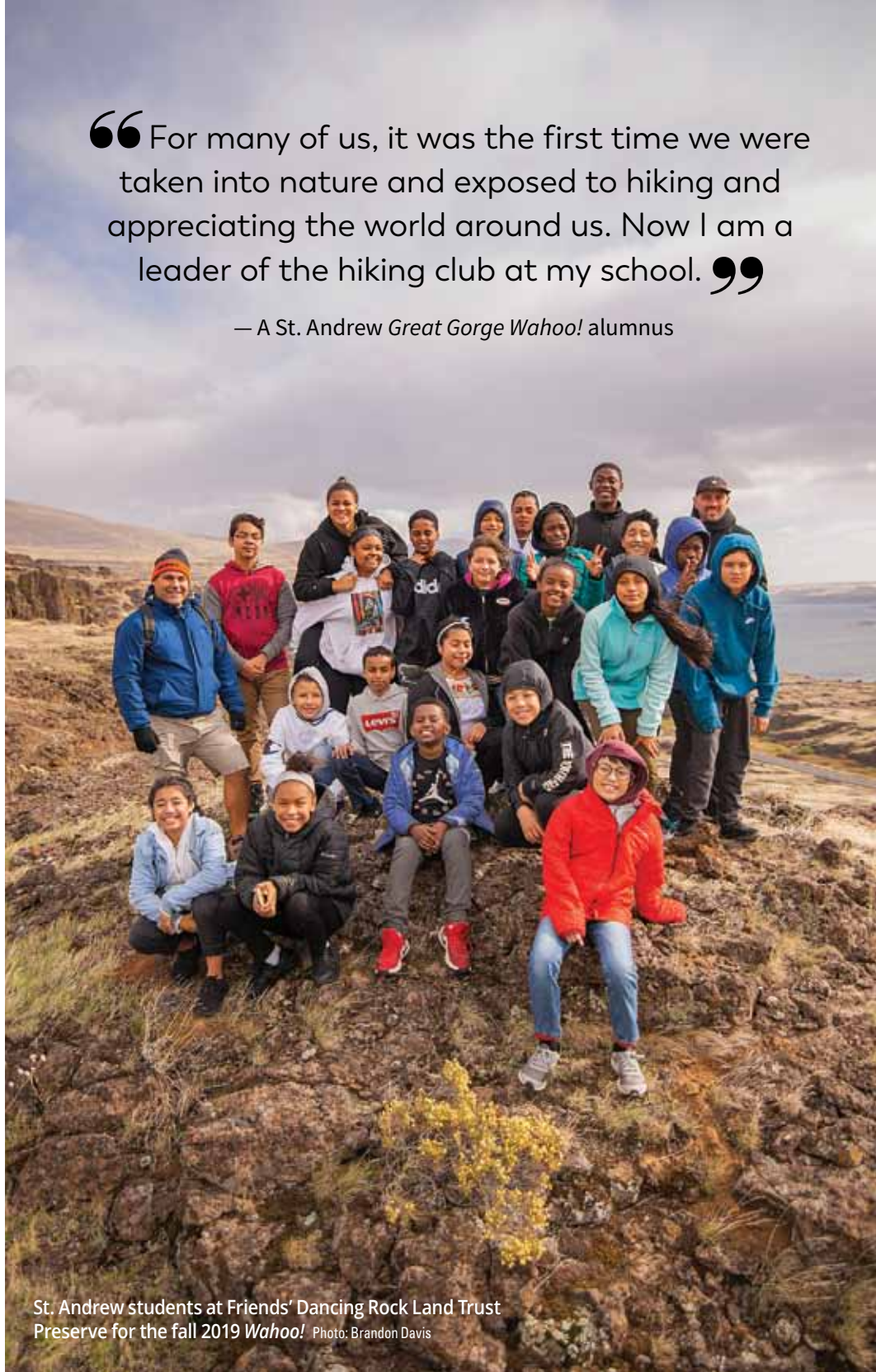
St. Andrew students at Friends’ Dancing Rock Land Trust Preserve for the fall 2019 Wahoo!