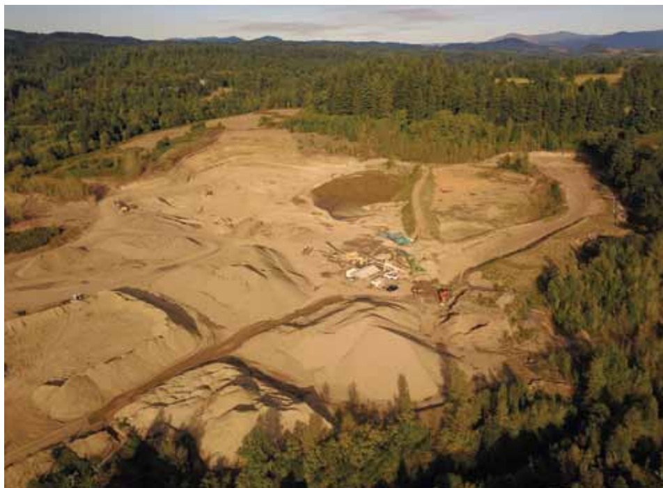
Aerial view of the Zimmerly mining site inside the western National Scenic Area boundary near Washougal, Washington.

Thus far, the Gorge Commission staff has not taken any enforcement measures to