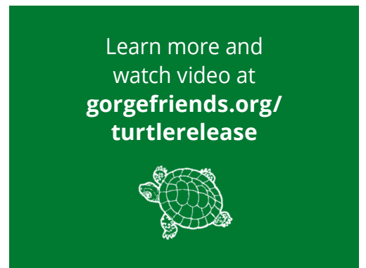
Education and hands-on engagement at the turtle release in September.