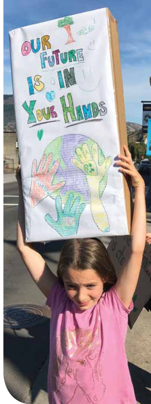
A young Gorge climate striker.

Gorge youth and community climate activists wrapped up their initial climate strike actions by offering