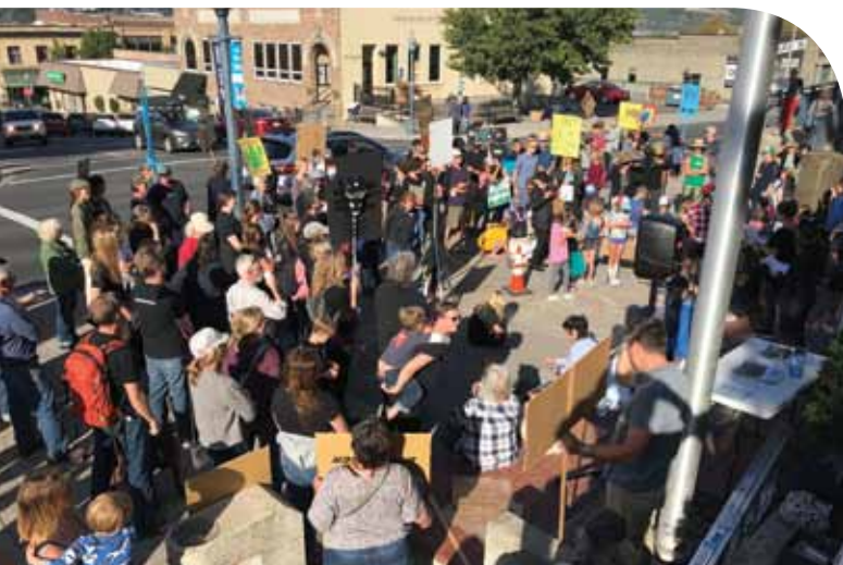
Hood River's Climate Strike action featured speakers, activity planning, a march, and climate education.

comments at the Gorge Commission's October 8 meeting in Cascade Locks. The management plan for the Columbia River Gorge National Scenic Area, which is currently under review, contains no mention of climate change. Youth and community leaders at the meeting urged the Gorge Commission to include mandatory steps in the 2020 management plan to support climate resilience in the Columbia Gorge in the years ahead. ■