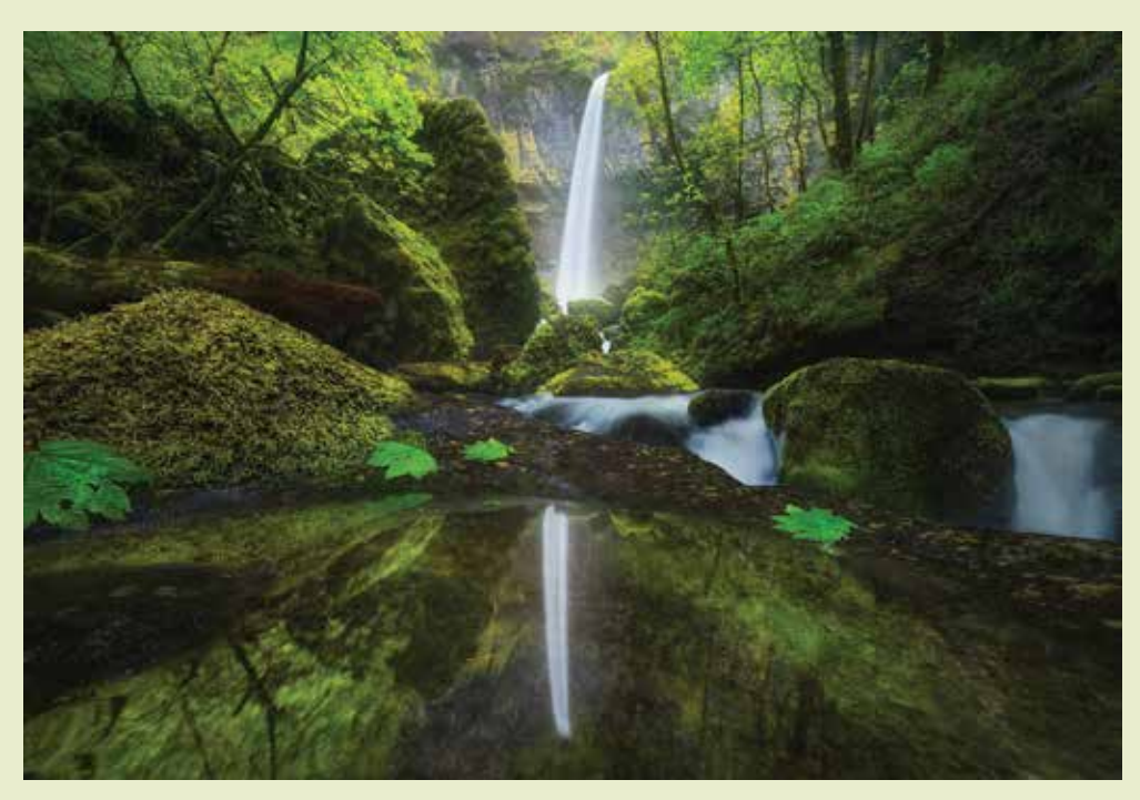
"Mirror," winner of Friends' 2017 Photo Contest, taken at Elowah Falls.

Tickets available in February. gorgefriends.org/luncheon