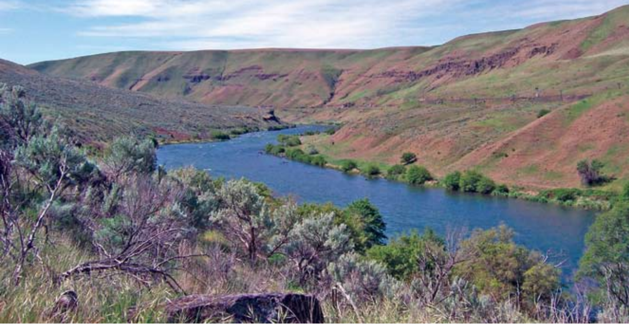
The Deschutes River Trail east of the Cascades offers early spring sunshine and wildflowers.