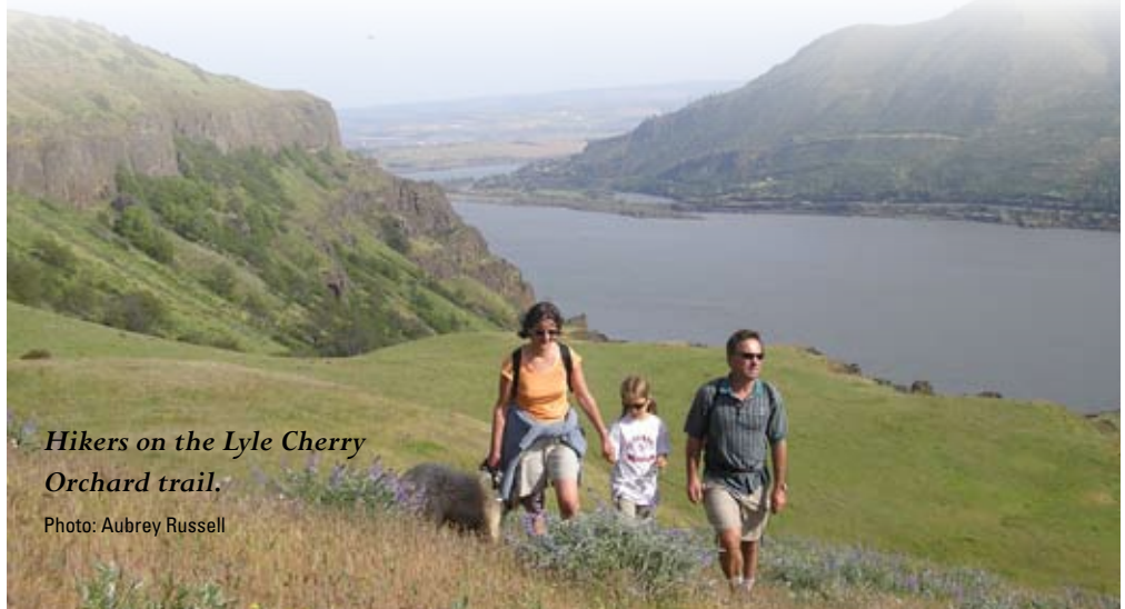
Hikers on the Lyle Cherry Orchard trail.

The Land Trust’s priorities for this spectacular property are to keep it open to the public for hiking, preserve habitat for wildlife, and protect its scenic vistas for generations to come. See our hiking brochure or check www.gorgefriends.org/hikes for this spring’s outings at the Cherry Orchard.