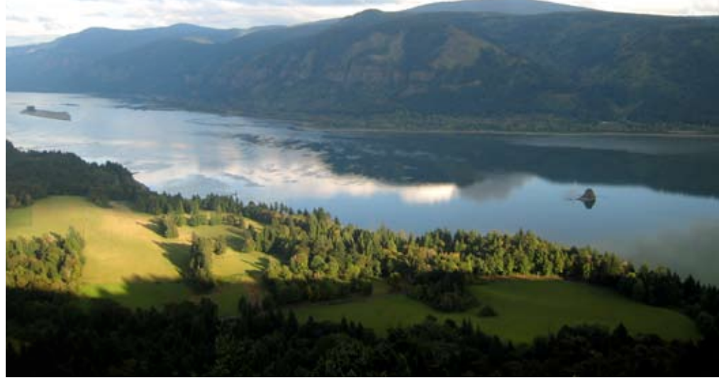
Late afternoon light reflects on the glassy river, seen from Cape Horn.

Over the past ten years, Friends has worked to facilitate land acquisition, collaborating with the Forest Service and Cape Horn Conservancy, a community group, to ensure that the trail will offer hikers a world-class recreation opportunity. Countless hours were spent carefully analyzing existing trails,