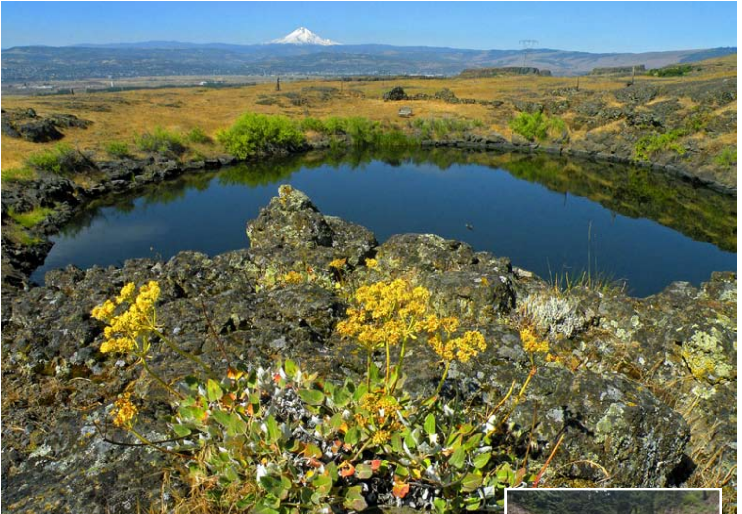
Kolk ponds such as this one on Friends' Dancing Rock property were left by forceful whirlpools during epic floods that inundated the Gorge 12,000 years ago.