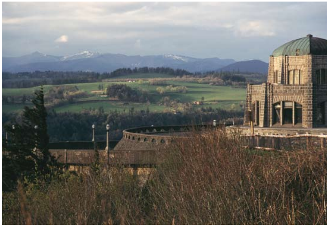
A classic view of pastoral land at Mt. Pleasant, from Oregon's Crown Point Vista House.

Friends of the Columbia Gorge works to ensure that the beautiful and wild Columbia Gorge remains a place apart, an unspoiled treasure for generations to come.