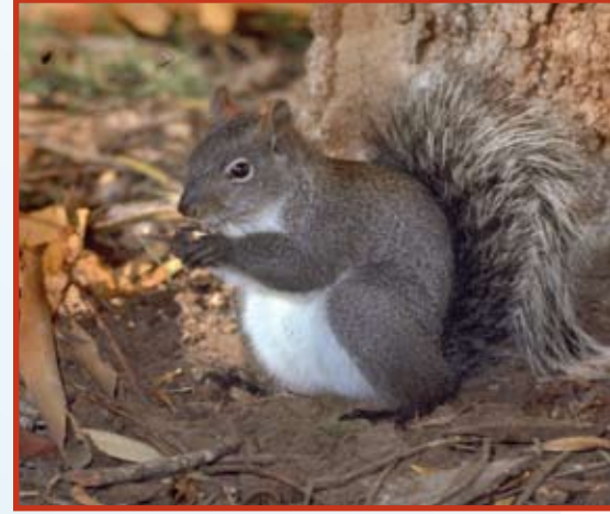
Western gray squirrels in the Gorge are losing habitat to residential development.

Third, where possible, residential driveways and utilities should be consolidated to protect resources. Finally, at least 75% of the overall property must be permanently protected from development. The Gorge Commission held that, in this case,