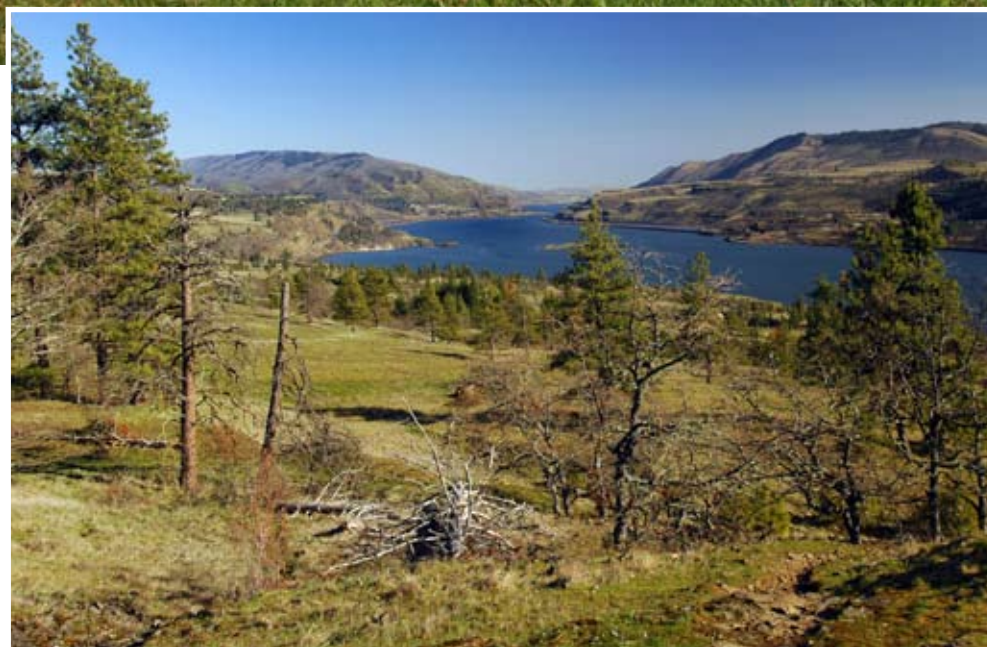
Catherine Creek's scenic trails draw hikers of all ages and abilities.

From east to west, the story of public land acquisition in the Gorge is evident. The two western gateways to the Gorge – the Sandy River Delta in Oregon and Steigerwald National Wildlife Refuge in Washington – were once zoned as industrial lands; habitat and resources were not protected. Today, more than 3,000 acres of these Gorge