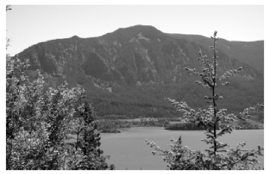
The proposed casino site in Cascade Locks is seen here from Washington SR-14.

Friends and Gorge landowners are considering appealing the decision to the Oregon Court of Appeals. Friends will work to make sure that commercial uses are balanced in a way that protects scenic, natural, cultural and recreation resources of the Gorge, and also the rights of neighboring property owners.