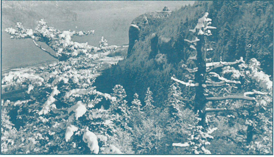
"Gorge in Winter"

Outreach Program Begins 1993 with Many Public Opportunities Ahead