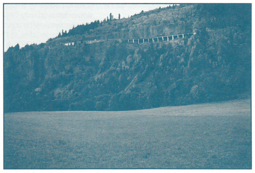
The Evergreen Highway at Cape Horn.