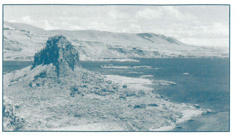
View of beautiful Miller Island

Bring warm clothes, water bottle, brown bag lunch, binoculars, and a camera. We'll all have a great time exploring!