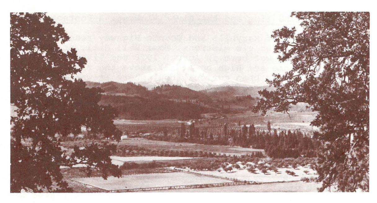
Photo: Hood River & Hood River Valley /R.I. Gifford Courtesy of The Oregon Historical Society #47082

HOOD RIVER - THE HIDDEN VALLEY Part One - The Early Years