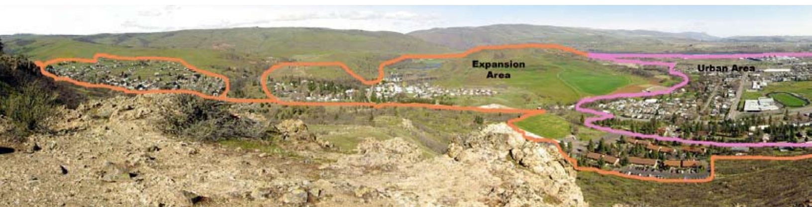
The west side of The Dalles seen from Chenoweth Table, showing proposed expansions and current boundary.

In the Scenic Area Act, Congress prohibited wholesale expansion of urban areas into surrounding Scenic Area lands, but left the door open for minor urban boundary revisions, subject to