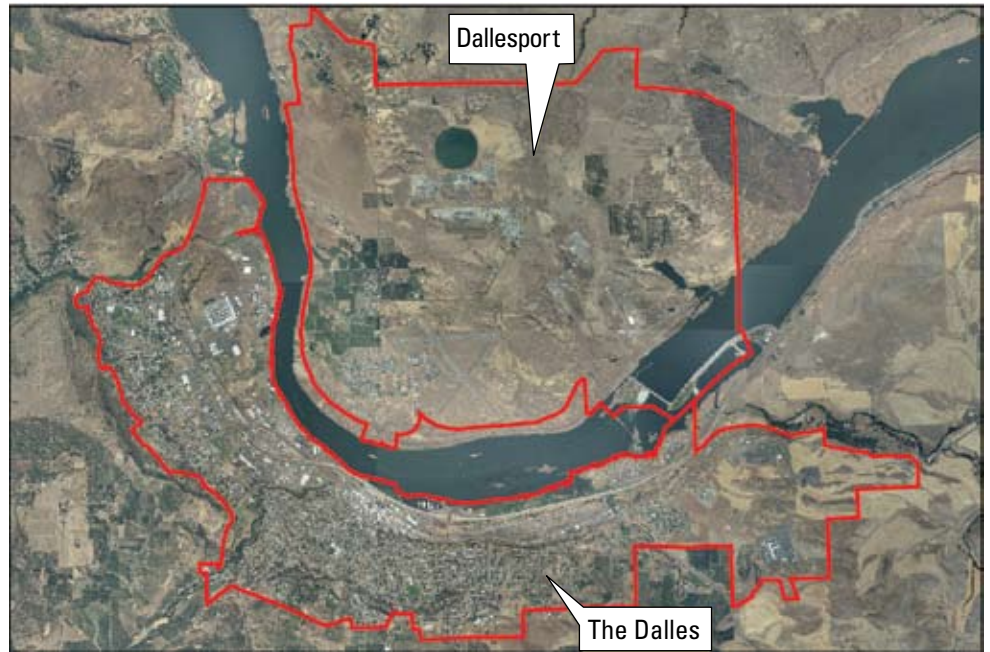
Vacant land in the Dallesport urban area (which shares an airport with The Dalles ) could easily accommodate decades of regional growth. Map: Friends of the Columbia Gorge GIS

in perpetuity. Since the 1986 passage of this landmark legislation, the Gorge has experienced moderate population growth, but because of the generous urban area boundaries created by the legislation, no serious attempt at major urban area expansion has come up until recently.