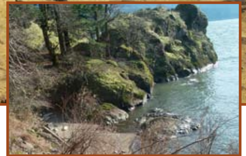
Friends' riverfront property near Stevenson.