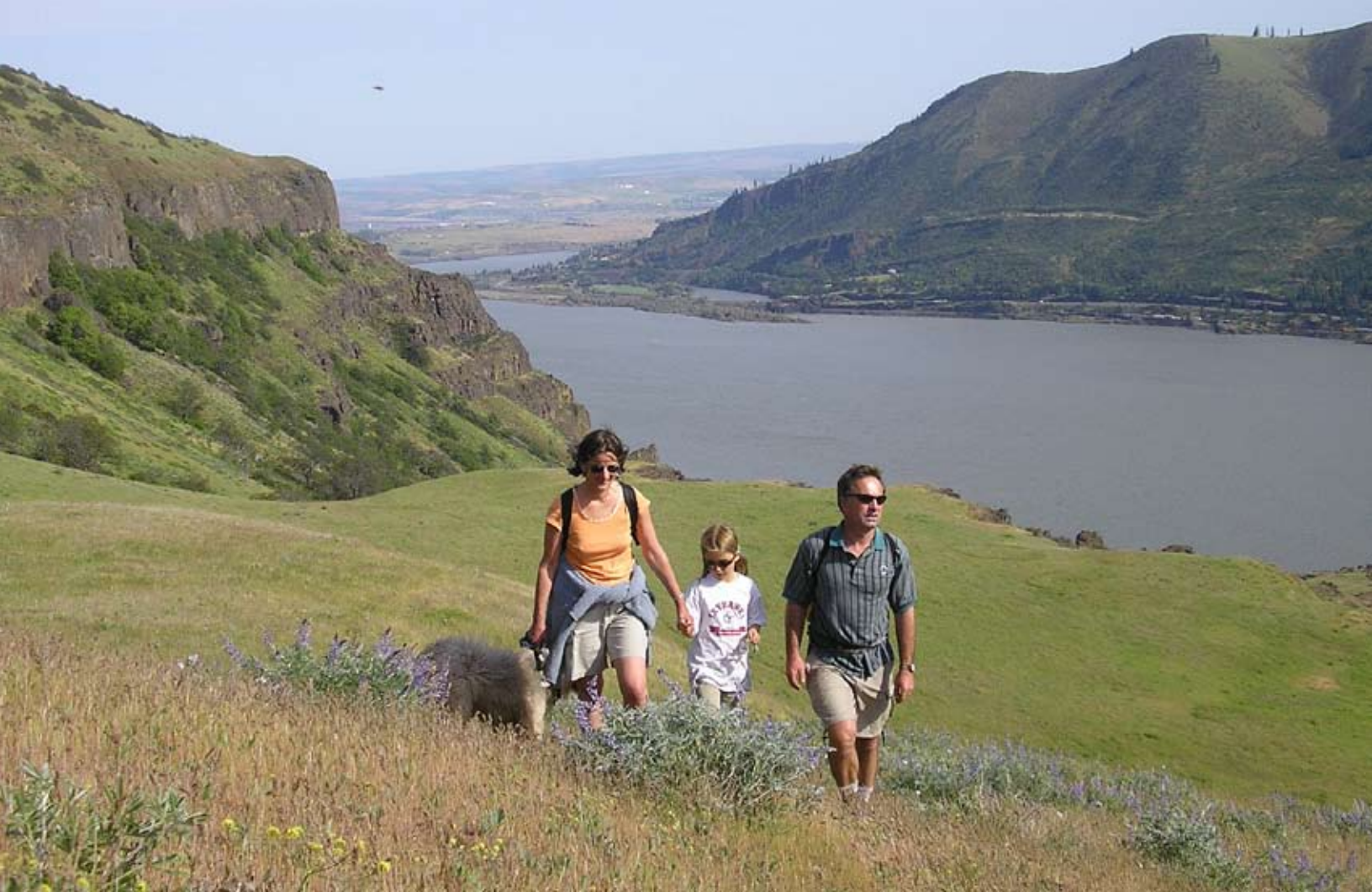
A spring outing above the river.

in Oregon and Washington to ensure appointment of Gorge Commissioners who support the National Scenic Area Act and who will provide leadership to restore the Gorge Commission's role and reputation as guardian of the outstanding resources of the Columbia River Gorge. The Governors of Oregon and Washington have the authority and the responsibility to make this happen. See "Take Action" on page 2 for more details.