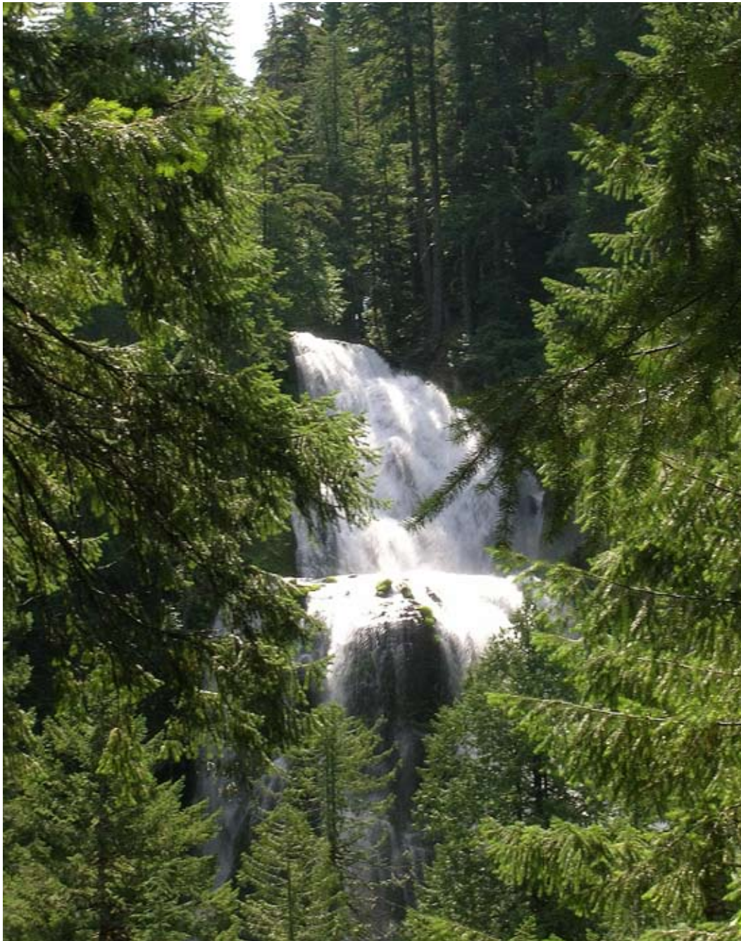
Falls Creek Falls.

Directions: From I-84 take Exit 44 Cascade Locks, and cross the Bridge of the Gods to Washington. Turn right on WA SR-14 heading east. At Wind River Hwy, turn left toward Carson. Continue north on Wind River Road No. 30, past Panther Creek to Forest Road No. 32062-057. Turn right and follow the signs to Lower Falls Creek Trail No. 152A. NW Forest Pass required.