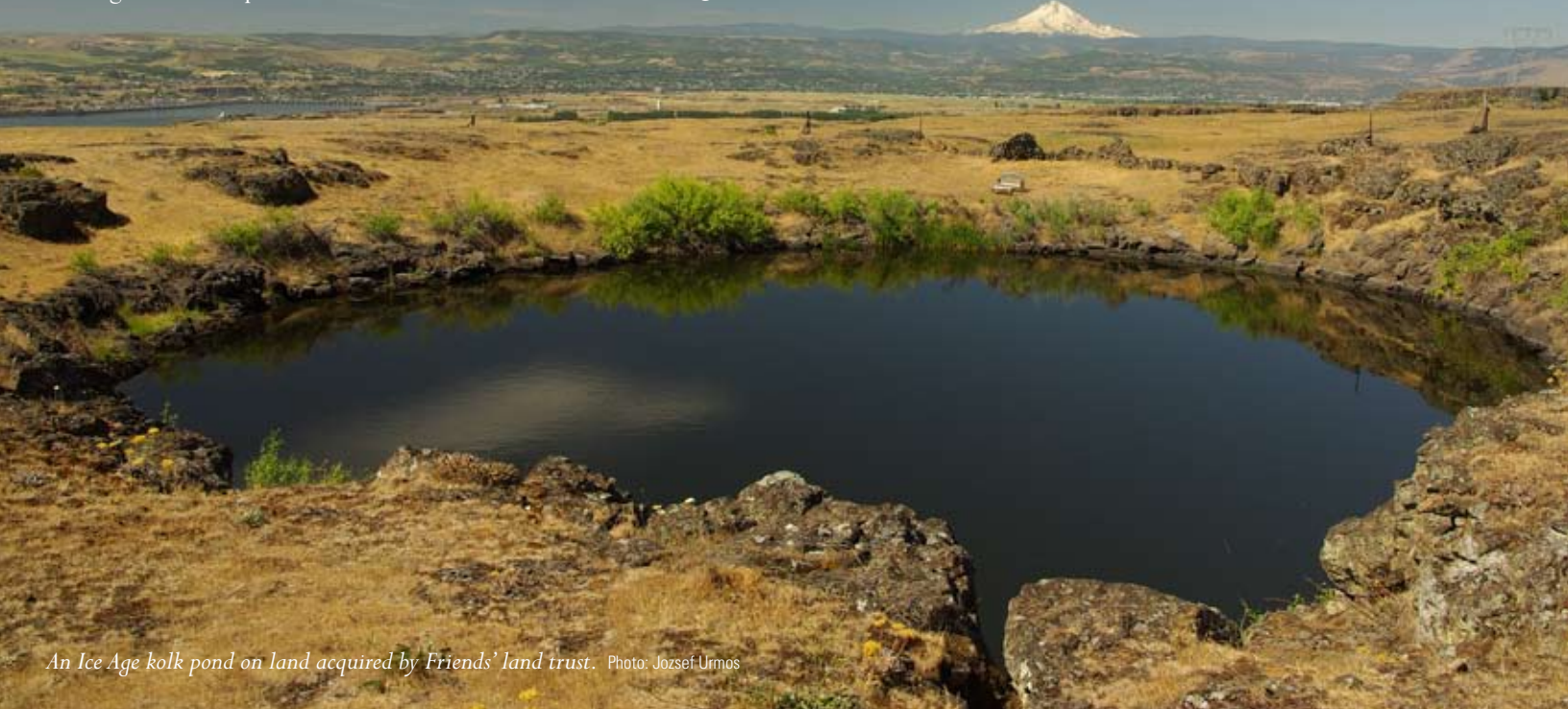
An Ice Age kolk pond on land acquired by Friends' land trust.