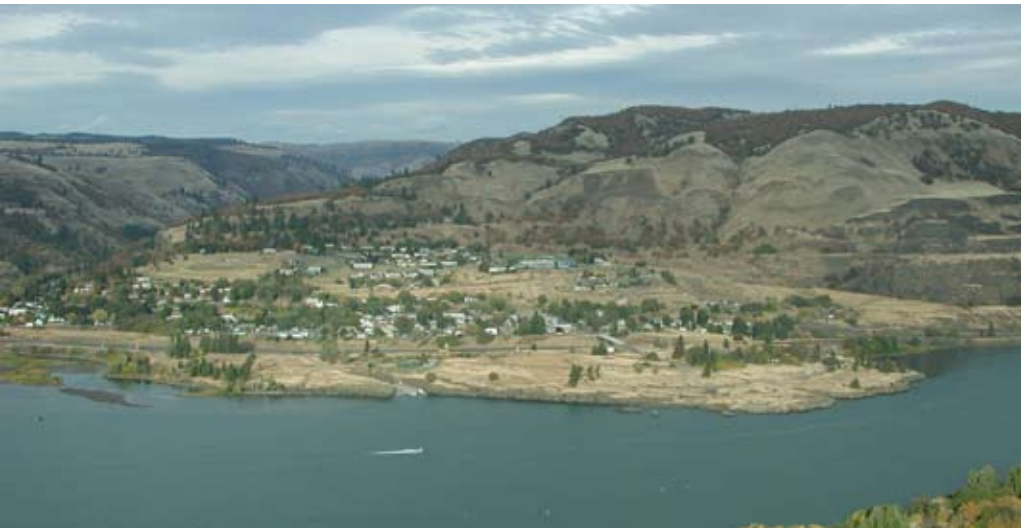
The City of Lyle is proposing an urban area expansion of more than 240 acres, above and west of the developed area in this photo.

stringent criteria requiring protection and enhancement of scenic, natural, cultural, and recreation resources; and protection of agricultural lands, forest lands, and open spaces. The Act also requires a demonstration of the need to revise an urban boundary based on legitimate population growth estimates and a demonstration of maximum land use efficiency within and along existing urban boundaries. Under the Scenic Area Act, only the Gorge Commission may approve a minor revision to an urban area boundary.