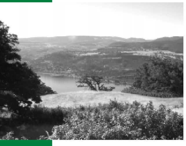
The oak, fir, and pine forests of Burdoin Mountain (above) may face aggressive "thinning" under the Healthy Forest Protection Act.

This spring the Columbia River Gorge office of the U.S. Forest Service kicked off local implementation of HFRA. The first site chosen was Burdoin Mountain, located just east of Bingen, Washington where the Forest Service owns 466 acres of public land, much of which was acquired through National Scenic Area Act authorization.