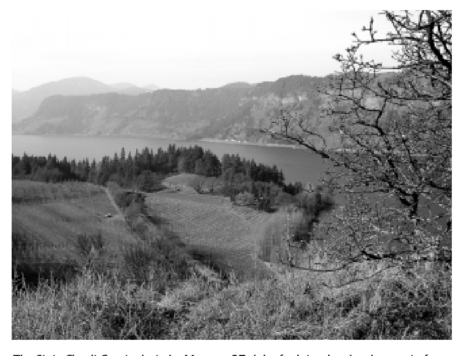
The State Circuit Court rejected a Measure 37 claim for intensive development of this scenic farmland at Ruthton Point.

Burdoin Mountain has many varied types of forest of different ages, from pure fir stands to mixed fir and pine, pine/oak, and oak/savanna. While careful thinning may be appropriate in certain areas, the Forest Service is proposing an extensive, one-time treatment. This approach may harm wildlife including western gray squirrels, listed as "threatened" in Washington.