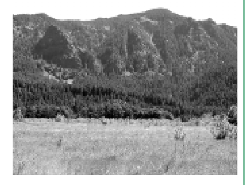
This open meadow below classic Gorge cliffs is the proposed site for a 500,000-square-foot casino.

The coalition's members generated thousands of letters to the Department of Interior and elected officials. According to the Interior Department staff, they received a