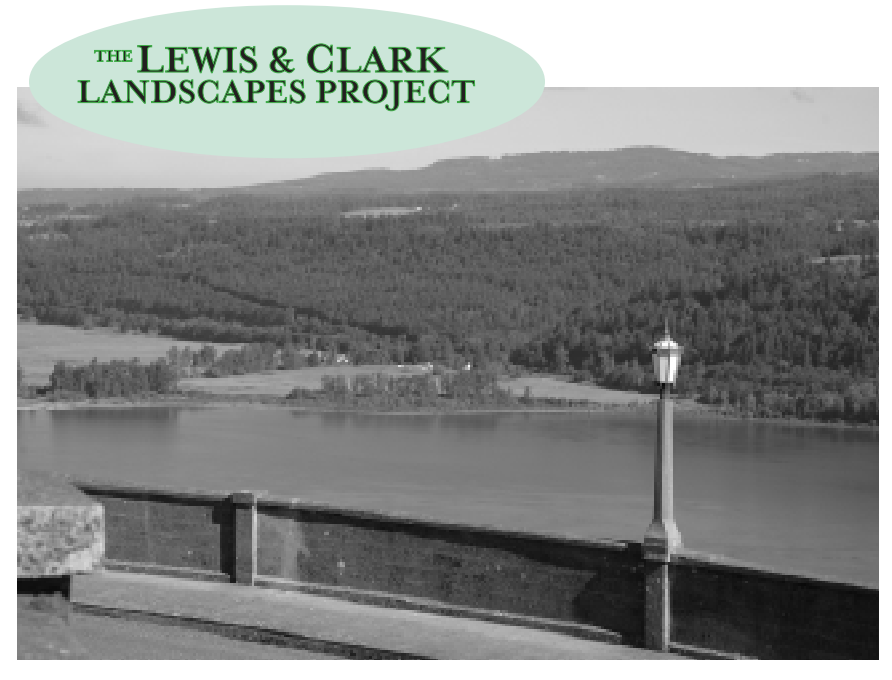
A key scenic property at Point Vancouver across the river from Crown Point is a priority for purchase into public ownership with Gorge land acquisition appropriation funds in 2006.

Six priority properties are slated for acquisition with the appropriated funds in 2006, including three parcels along the "waterfall alley" on the Historic Highway in Oregon and a significant property on the river in Washington directly across from Crown Point. The Forest Service must now determine how to best use the $1.5 million to bring critical landscapes into public ownership in the coming year.