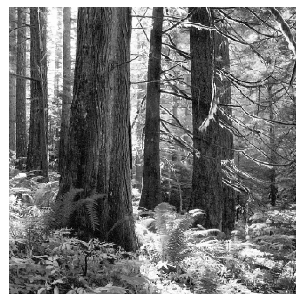
These old-growth cedar forests would be permanently protected under the wilderness proposal.