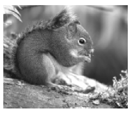
Friends' legal actions helped protect habitat for sensitive species like this western gray squirrel.

habitat. Many ancient lots near the eastern Skamania County border contain oak woodland habitat that helps maintain one of only three known remaining populations of western gray squirrels in Washington State. The squirrels are dependent upon large, old mixed oak and conifer forests and are