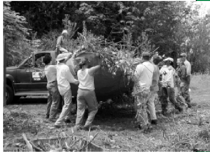
Friends' volunteers at Bridal Veil in July loaded six dump trucks with invasive blackberry vines.