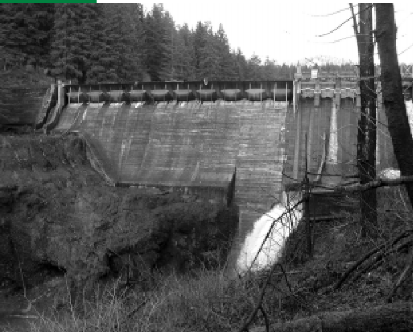
Removal of Condit Dam will allow salmon and steelhead to access 18 miles of river habitat that has been blocked for 90 years.