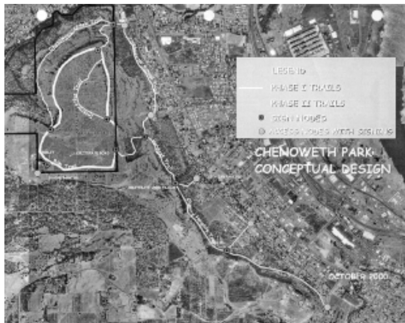
Aerial view and conceptual trail design for Chenoweth Table, recently purchased by the Forest Service. To the right is the city of The Dalles.

Friends’ successful appeals in these and other cluster development cases have helped raise awareness about how cluster developments that are not thoughtfully planned by developers and carefully reviewed by the counties will harm sensitive resources such as wildlife habitat, scenic views, native plants, and cultural resource sites. ■