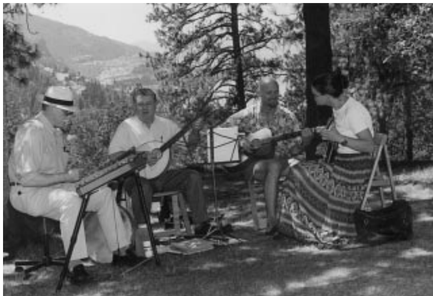
Live music, shady trees and breezes combined to delight guests at Friends' annual picnic, held this year in Mosier.