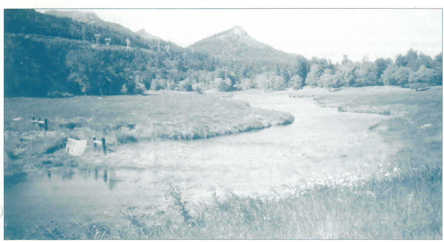
Pierce Ranch is now a National Wildlife Refuge. Susan Cady will lead a special birding tour of the refuge for Friends of the Columbia Gorge members and guests at our annual Summer Picnic on Sunday, July 29.

The Shire is about 29 miles east of Vancouver. Turn off on the south side of Washington Highway 14, just across from the Skamania County Shops between mileposts 28 and 28. Look for the gravel piles and chainlink fence on the north side of the road and turn off the highway to the south through a red gate. (Keep a sharp eye out; the gate is inconspicuous until you get close.) If you are coming from the east, be very careful in making your turn across the highway. If you are coming from the west, there is a gravel shoulder. After you come through the gate, proceed with caution as you cross the tracks of the Burlington Northern railroad, and then drive down to the parking area.