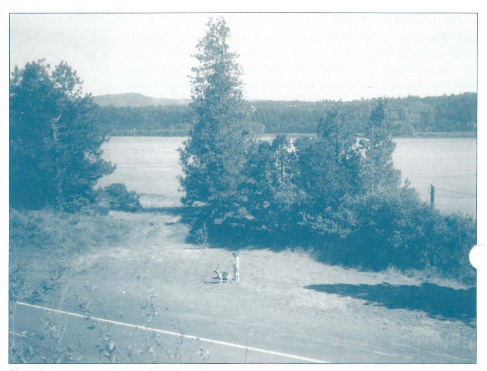
Site of the proposed Broughton Landing resort.

have urged the Gorge Commission to assure that the restaurant is designed to serve resort customers only, and not to draw the general public away from restaurants which now exist or may in the future be developed in the urban areas. We have also urged the Gorge Commission to assure that arrangements for housing for resort employees will not result in an everwidening circle of residential development around the resort.