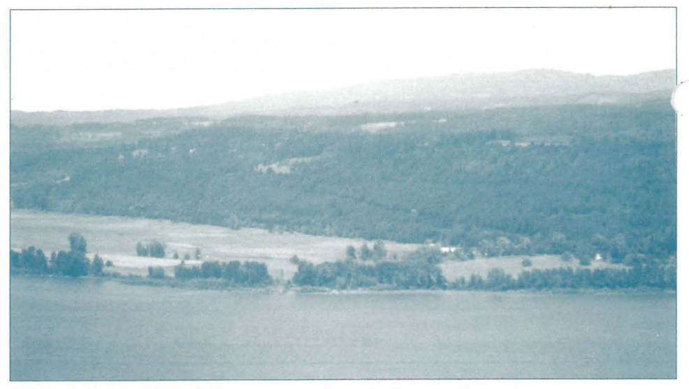
Steigerwald Lake will benefit from a cooperative wetlands restoration project.

Columbia Gorge United has indicated that it plans to appeal the decision to the Ninth Circuit Court of Appeals in San Francisco. If appealed beyond that stage, the case could reach the U.S. Supreme Court. Friends of the Columbia Gorge will continue to be involved in any appeals of the case.