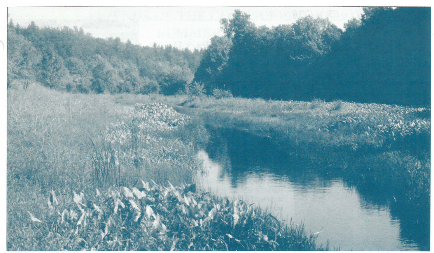
This 1977 photograph by Russ Jolley shows what Rooster Rock State Park looked like before cattle were introduced. The plants in the foreground with leaves shaped like arrowheads are wapato.