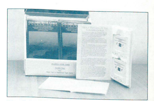
The Columbia River Gorge Guided Tour.