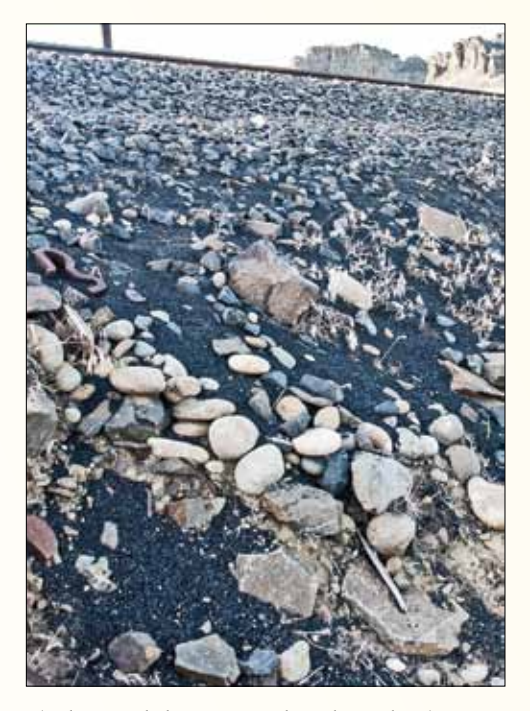
Coal-covered slope near rail tracks in the Gorge.

s a direct result of litigation brought by Friends of the Columbia Gorge and allies, BNSF Railway Company has agreed to clean up and mitigate coal pollution it has spilled from uncovered coal trains at multiple sites in the Gorge, and