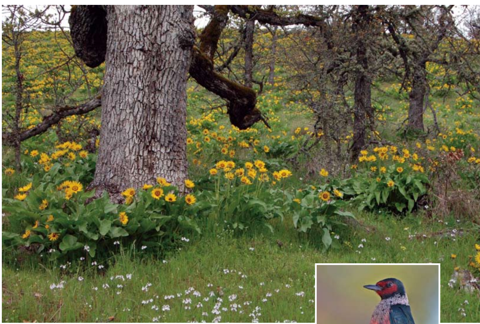
Above: Oak woodlands are threatened by cummulative impacts. Right: The Lewis's woodpecker — a candidate for state protective listing — depends on Gorge habitat.

if properly sited and screened, allowing 10 or more such developments could dramatically change the landscape.