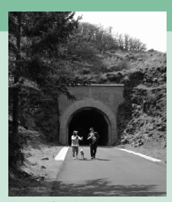
The east end of the Twin Tunnels today.

Then: In 1980, a five-mile section of the Historic Columbia River Highway between Hood River and Mosier was abandoned and reverted back to private landowners. The once-beautiful "Twin Tunnels" were filled with construction rubble from Interstate 84, and gravel pits operated where visitors once enjoyed scenic views. Friends soon began advocating for restoration of this section of the highway as a family-friendly trail, and with the support of then-Senator Mark Hatfield, funds were secured to purchase the lands and dig out the tunnels. A $500,000 gift from Bruce and Nancy Russell averted the need for state funding and assured that the road would be preserved as a public trail for non-motorized use only.