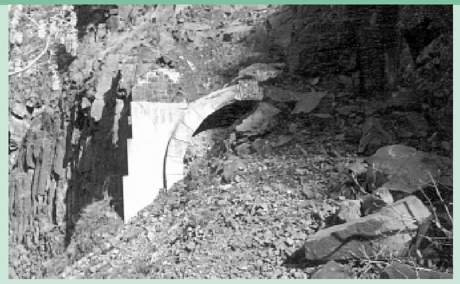
The west end of Twin Tunnels prior to excavation.

Then: In 1980, a five-mile section of the Historic Columbia River Highway between Hood River and Mosier was abandoned and reverted back to private landowners. The once-beautiful "Twin Tunnels" were filled with construction rubble from Interstate 84, and gravel pits operated where visitors once enjoyed scenic views. Friends soon began advocating for restoration of this section of the highway as a family-friendly trail, and with the support of then-Senator Mark Hatfield, funds were secured to purchase the lands and dig out the tunnels. A $500,000 gift from Bruce and Nancy Russell averted the need for state funding and assured that the road would be preserved as a public trail for non-motorized use only.