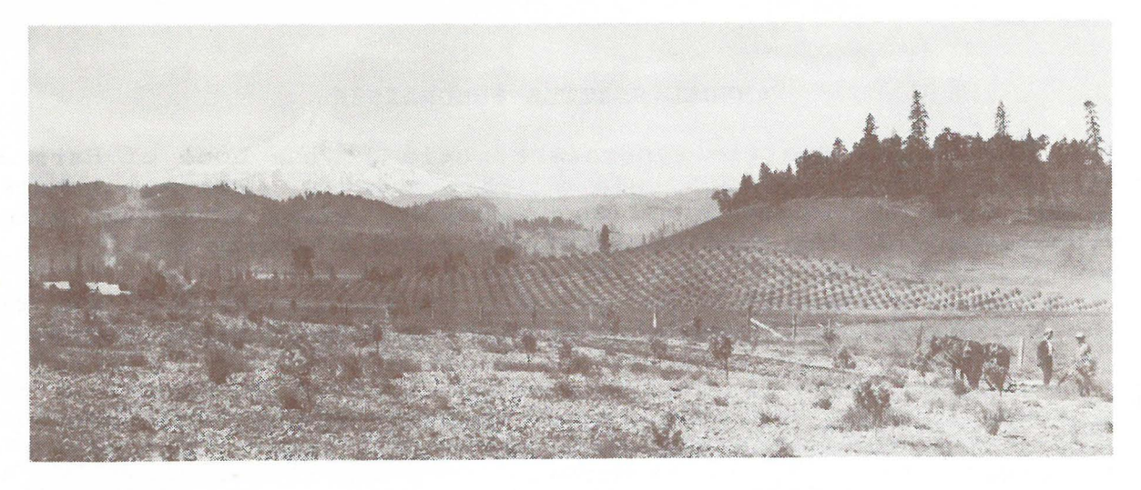
PART TWO - "THE NEW YORKERS"

In the spring the Hood River Valley foams with the blossoms of apple, pear and cherry trees and looks as if the glaciers of Mount Hood, at its southern end, had melted to flood the valley floor.