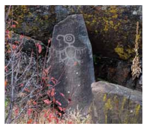
Petroglyph at Columbia Hills State Park. See October 19 hike.

Bring your preferred photography device and follow leader Gloria Gardiner on the Pacific Crest Trail to Dry Creek Falls. We'll stop frequently for photo-ops on this slow-paced hike to capture early autumn foliage, rushing falls, and fire recovery in the area.