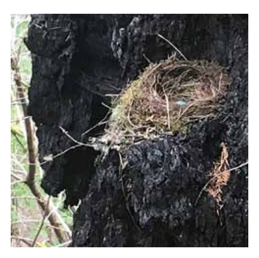
Charred old-growth bark holds a nest on Wahkeena Trail.

According to numerous studies, in future decades, climate change will produce increasingly drier summers in the Gorge. At the same time, recreational demand will increase as urban populations across the Pacific Northwest grow and the Gorge's reputation as a global tourism destination rises. Since more than 70 percent of all fires