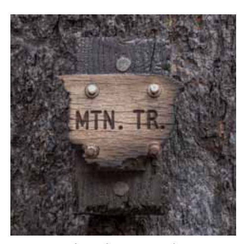
Remnants of a trail sign on Larch Mountain.

When the Gorge erupted into flames last September, it wasn't a question of whether Friends of the Columbia Gorge should act, but how we could best help. For decades, Friends has worked to mobilize the public and our members to address threats to the Gorge. The Eagle Creek fire