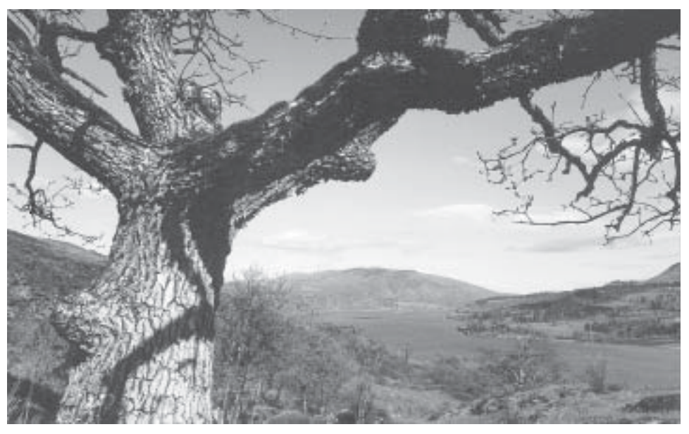
Friends' hike leaders have shared the wonders of the Columbia Gorge with hikers for 25 years.

First Field Day: Saturday, Feb. 18, 9:30 a.m.-4:30 p.m. Meet to team