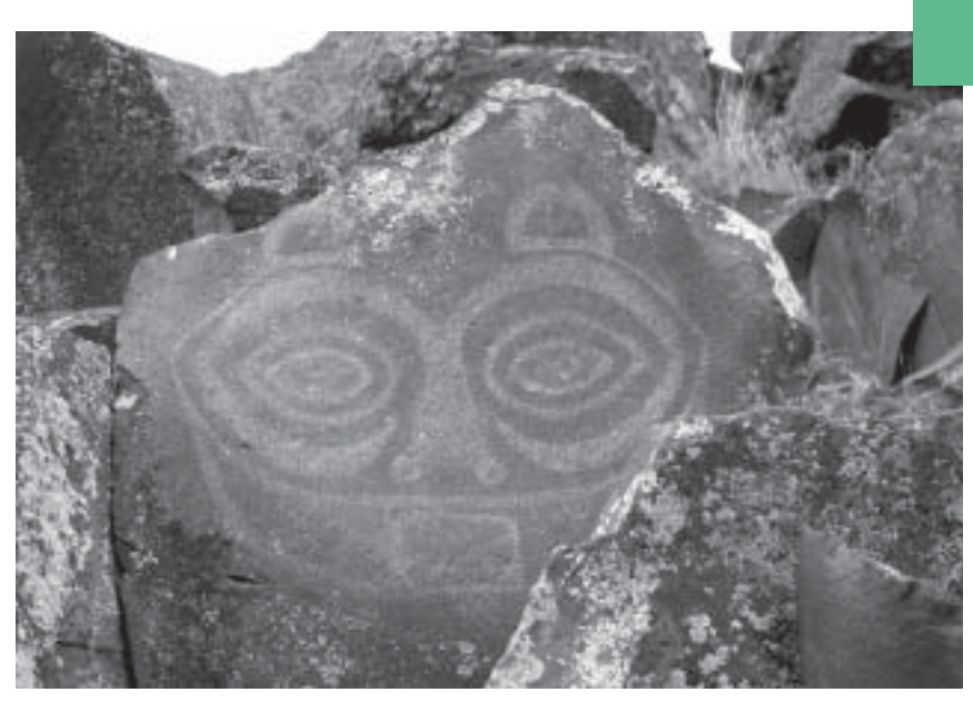
Tsagaglalal, also called "She Who Watches," has looked down from the rocks of the Gorge for thousands of years. This world-famous pictograph and other Native American rock imagery may be endangered due to acid rain and fog.

What's in the air? Winter acid rain and fog