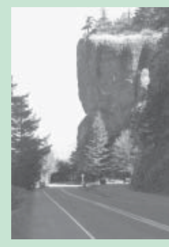
The Historic Highway is currently re-routed around the rock bluff where Oneonta Tunnel was located.

Even more exciting is ODOT's plan to reconnect the Historic Columbia River Highway from Cascade Locks to Hood River. The plan calls for a "new" Mitchell Point Tunnel to be blasted in the area south of the remnants of the original tunnel roadway. Recreating Mitchell Point Tunnel would serve to reverse one of the great historic losses of the Columbia Gorge.