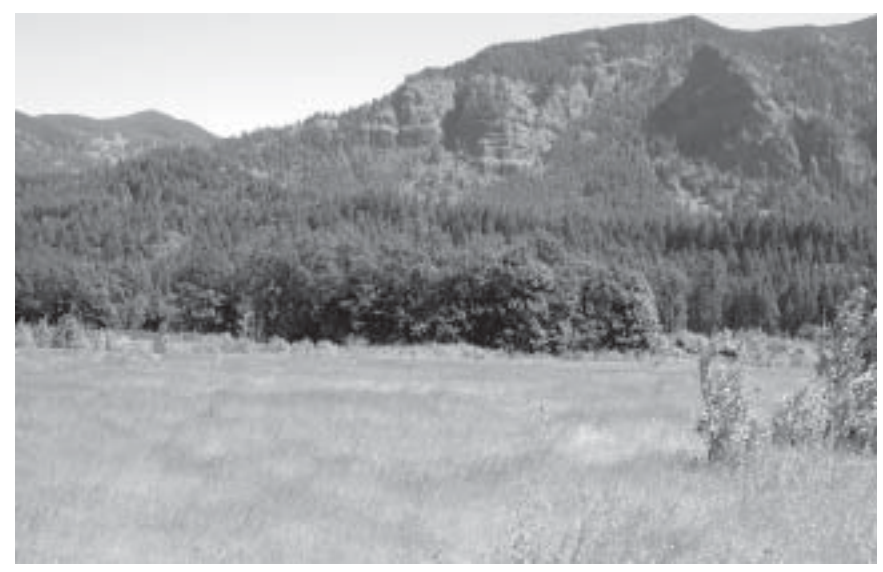
Proposed casino site on Cascade Locks port land; the Pacific Crest National Scenic Trail runs along Gorge cliffs in the background.

As this issue plays itself out, Friends will make sure that historic preservation and Columbia River Gorge protection are balanced in a way that protects scenic, natural, cultural, and recreation resources of the Gorge, and also the rights of neighboring property owners.