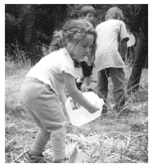
Children carefully tended newly planted native species during the summer.

Today, visitors at Bridal Veil are greeted by a sign acknowledging Friends' volunteers, whose efforts have transformed the viewpoint. Even with plenty yet to be done, our volunteers have plenty of reason to be proud of their Bridal Veil success.