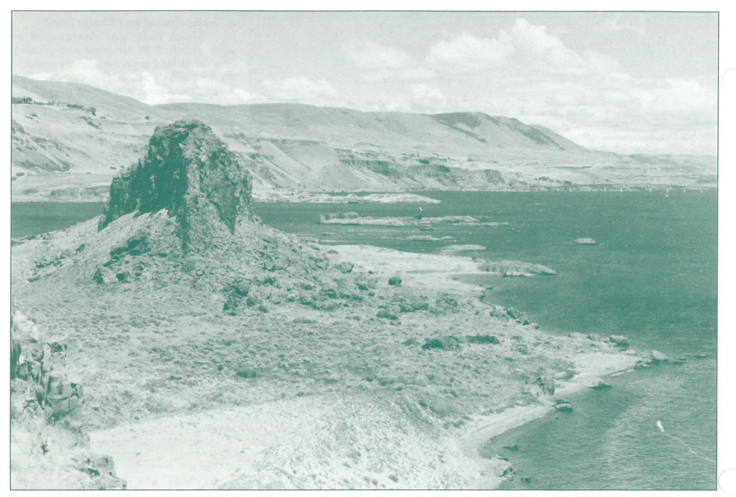
Miller Island rock formation. This island in the eastern Gorge hosts rare plant species which are currently safe from degradation by cattle.