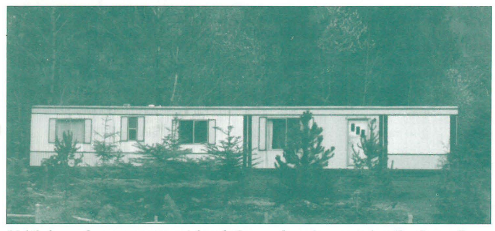
Mobile homes have no permanent foundations and can be removed easily. A new Gorge Commission policy, challenged by FOCG, would allow any mobile home in the Gorge to be replaced with a permanent, site-built home.

Any activity in the Gorge, however, has the potential to damage sensitive resources if not carried out with consideration, care and foresight. Several issues relating to windsurfing are of