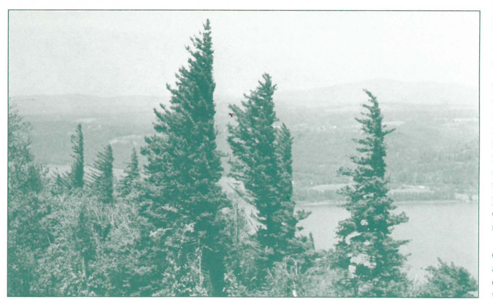
These trees in the western Gorge are eloquent testimony to the power of Gorge winds. Empty garbage trucks returning in these strong winds would present serious safety hazards.

In short, as the PUC protest continues, more and more questions have arisen about the appropriateness of this contract. Friends of the Columbia Gorge will be working hard to bring out all the relevant facts, and to keep these trucks out of the Columbia River Gorge National Scenic Area.