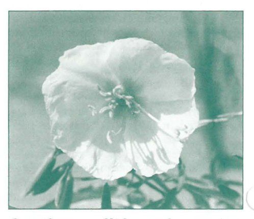
Oenothera pallida, pale evening primrose. This native wildflower is still relatively abundant, but other wildflowers on Miller Island are quite rare.

National Scenic Area Office and the Gorge Commission. We hope these agencies will continue protecting these special natural areas from cattle.