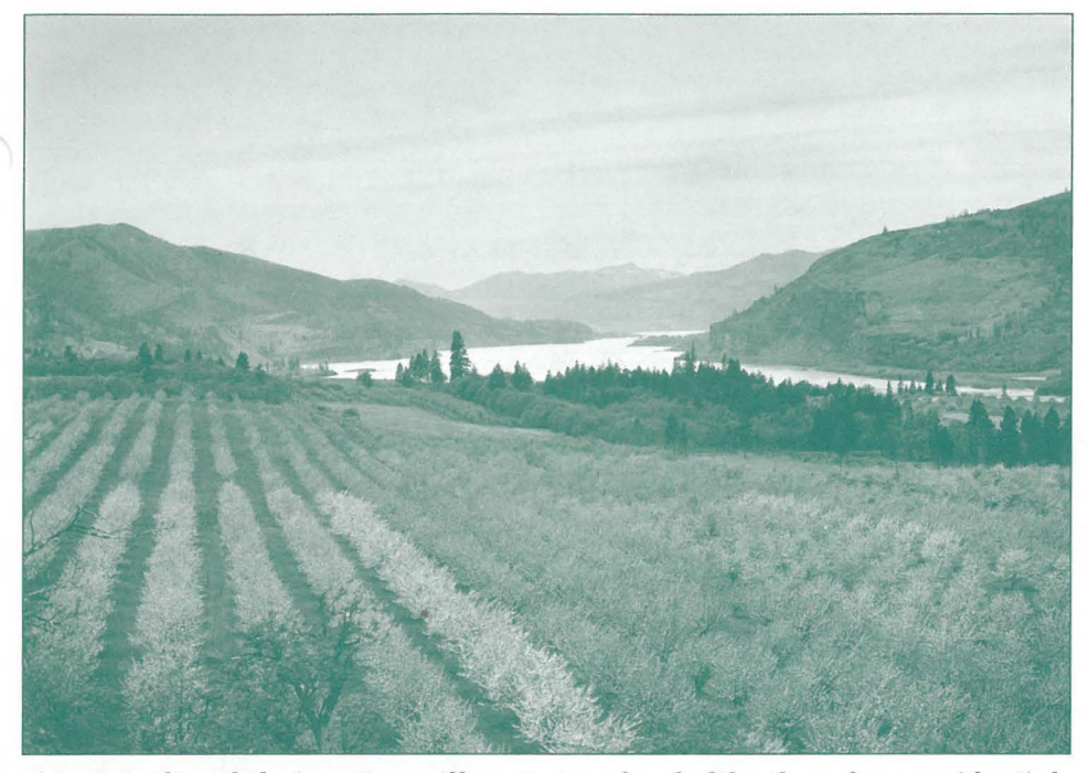
An agricultural designation will protect orchards like these from residential subdivision. Photo: Oregon Historical Society neg. no. 14759.