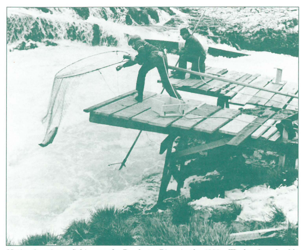
Native Americans fishing on the Deschutes River in the 1930s. Windsurfers should steer clear of treaty fishing areas to avoid interfering with fishing activities or damaging nets.