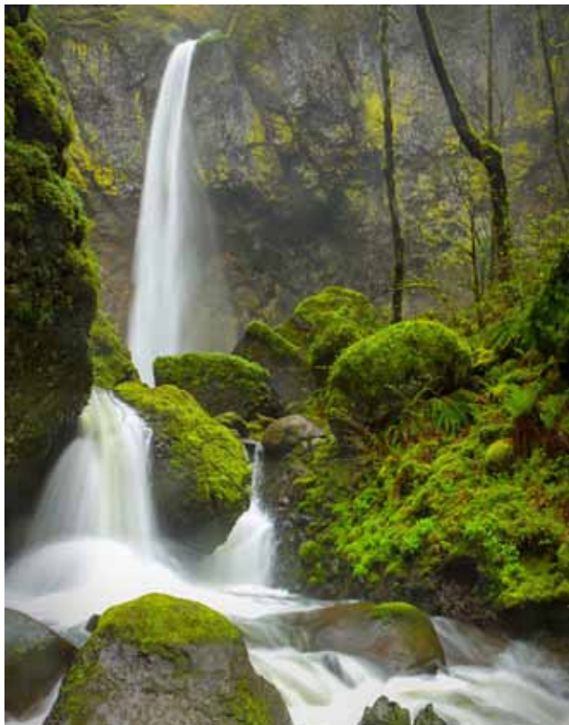
Elowah Falls.