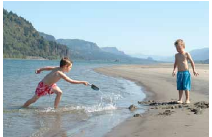
Cooling off in the river at Rooster Rock.