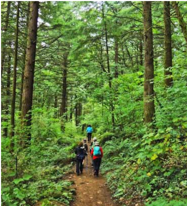
Hikers on the Angels Rest Trail.