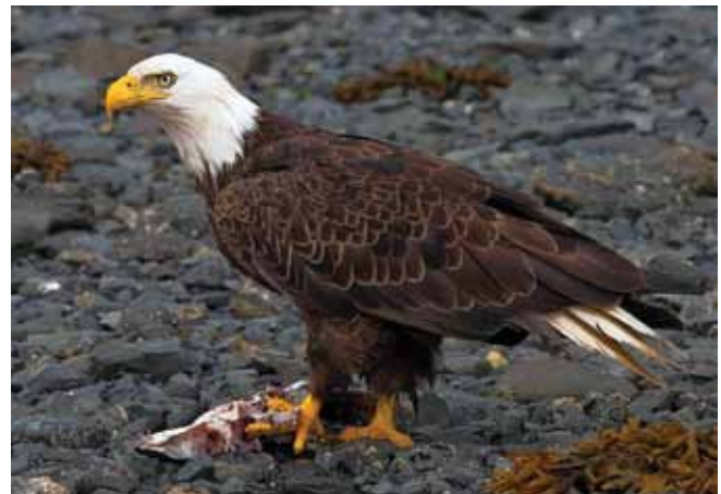
Bald Eagle and salmon.