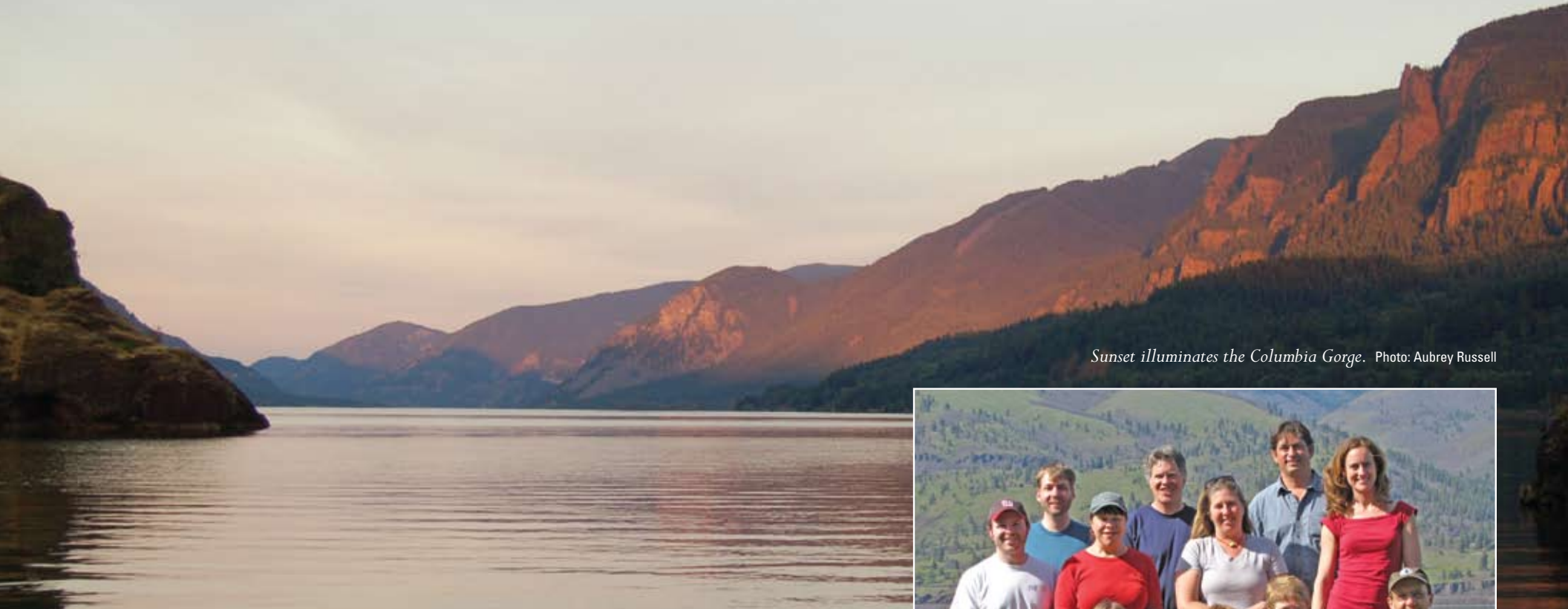
Sunset illuminates the Columbia Gorge.

Non Profit U.S. Postage PAID Ridgefield, WA Permit No. 94