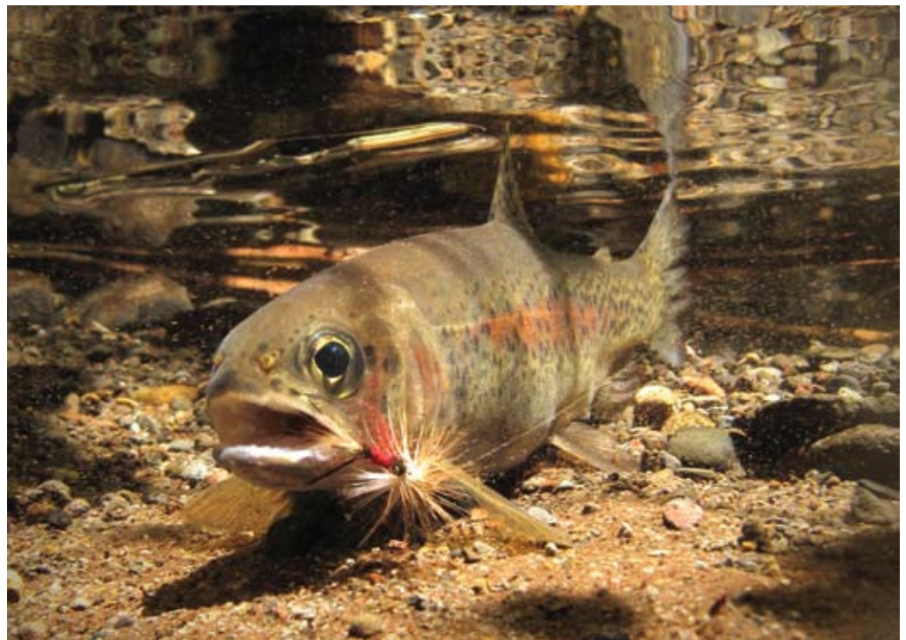
Columbia Gorge cutthroat trout.

high-water mark of the Missoula Floods that sculpted the lower reaches of the Gorge 13,000 to 15,000 years ago, suggesting an isolating event even prior to the floods. Whatever the case, the Columbia Gorge cutthroat trout – living nowhere else on earth – is another unique reason to celebrate the Columbia River Gorge. ■