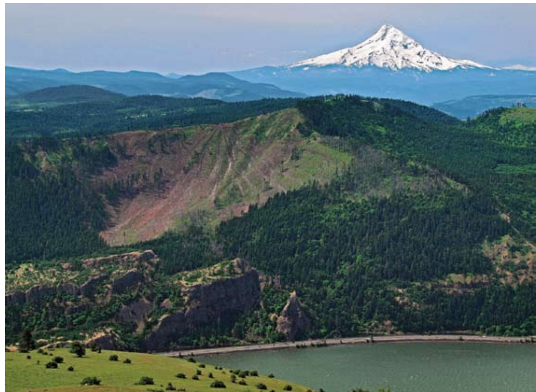
Top of clearcut is on GMA Open Space land, lower portion on exempt Indian Trust Land.

The proposal to designate the land from Hood River to Mosier Bluff as Open Space received more comments of support than any other area.