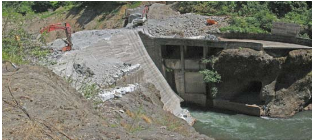
Condit Dam was breached in October 2011, reopening the river upstream to native salmon.

proceed, removal of even a relatively small volume of water from Rattlesnake Creek could drive stream temperatures into a lethal range for salmon and steelhead. In effect, the rezone would undermine the whole purpose of removing Condit Dam: restoring salmon and steelhead to their historic range.