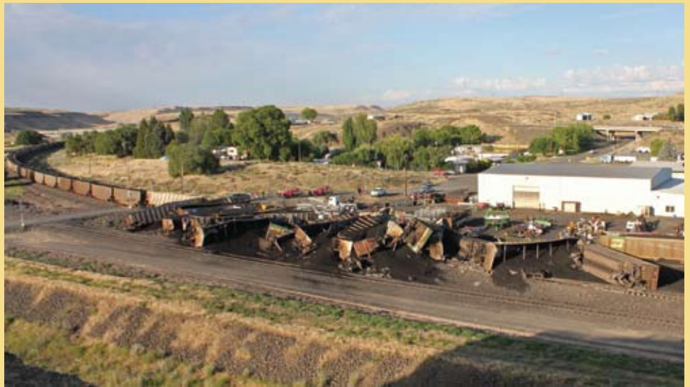
Coal train derailment on July 2 in Mesa, Washington, 140 miles east of the Gorge.

At this point, Friends of the Columbia Gorge does not believe that the Gorge Commission staff has objectively "investigated" its own actions, which allowed illegal logging to proceed on one of the most treasured landscapes in the Columbia River Gorge. Looking forward, Friends has concerns that the Commission staff's agenda may open up more GMA Open Space lands for logging in the future. ■