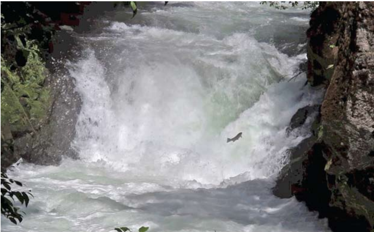
A steelhead passing BZ Falls this past July, 9.1 river miles above the breached Condit Dam.