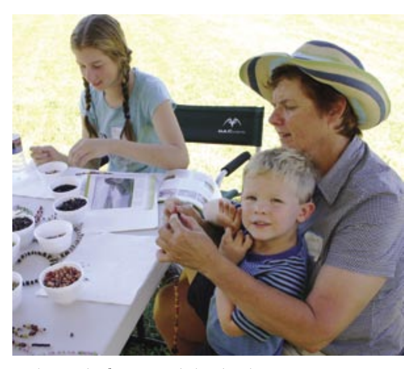
Families enjoyed crafts activities and a hayride at the picnic.

The $4 million campaign to raise funds for the purchase of the Cleveland and Collins properties and create a viewpoint honoring Nancy and Bruce Russell is well underway, with more than $1.2 million pledged to date. Friends board and staff are working with major donors and with funders in Washington state to realize our vision for a park at Cape Horn with views comparable to Oregon's Crown Point.