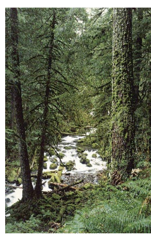
Upper Multnomah Creek and the surrounding old growth forest should be included in the Senate bill for protection as wilderness.

Let him know that there is overwhelming support for a Wilderness Bill that will preserve remaining wild lands around Mt. Hood and in the Gorge. Tell Senator Smith to expand designated wilderness to include Larch Mountain and Tom McCall Point, two unspoiled areas in the Gorge that are currently not protected by the House bill.