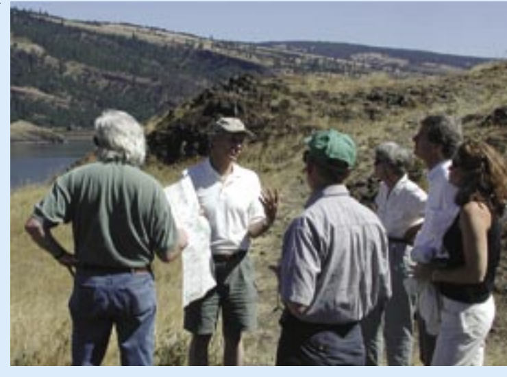
Landscape architects assisted Friends in reviewing Gorge rules during Plan Review.

To volunteer, contact us in Portland or Hood River at (503) 241-3762 or (541) 386-5268, or email info@gorgefriends.org .