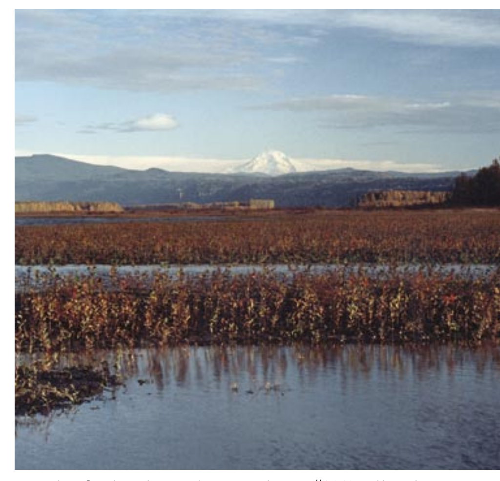
Mt. Hood seen from the Sandy River Delta. Metro Bond Measure #26-80 would extend protection along the Sandy River to the west side of the river.

ew poll results released in July show that the proposal to locate a casino in the heart of the Columbia Gorge is opposed by 71% of registered voters in Oregon. Respondents also opposed large-scale development in the Gorge by a margin of 74.5% to 16.5%. The statewide poll during the week of July 17 was conducted by Mercury Public Affairs. Four hundred voters across the political spectrum participated; the margin of error was plus/minus 4.9%. Friends participated in the joint poll with several other conservation groups addressing a wide range of environmental issues.