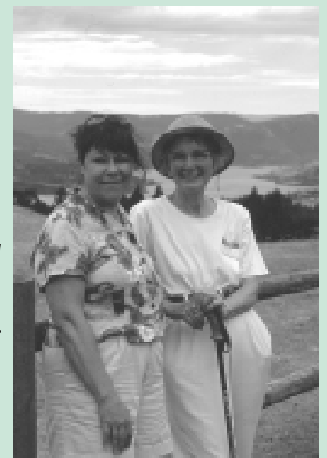
Top left: Families and friends enjoyed the view and learned about scenic protections.