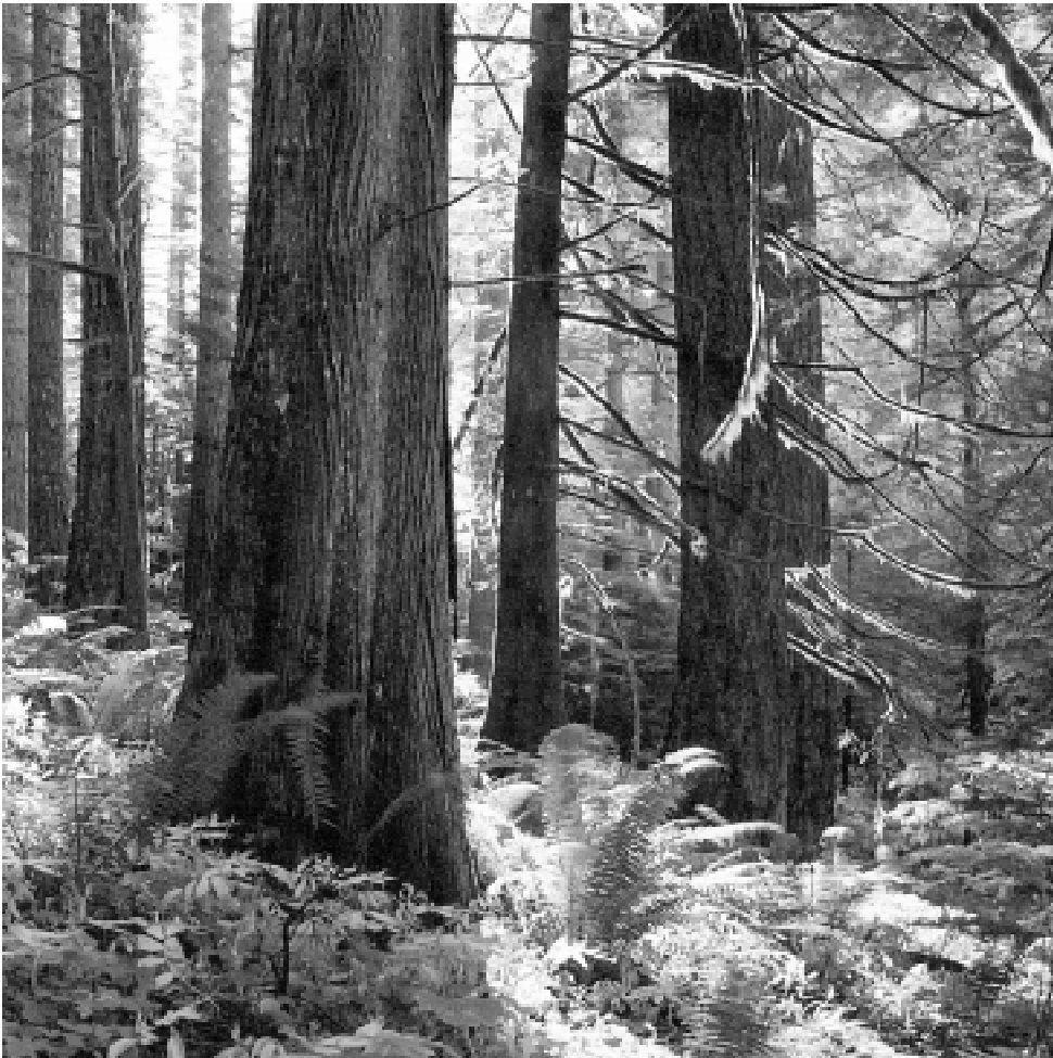
These old-growth cedar forests would be permanently protected under the wilderness proposal.