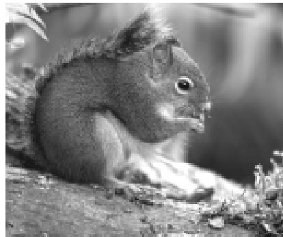
Friends’ legal actions helped protect habitat for sensitive species like this western gray squirrel.

habitat. Many ancient lots near the eastern Skamania County border contain oak woodland habitat that helps maintain one of only three known remaining populations of western gray squirrels in Washington State. The squirrels are dependent upon large, old mixed oak and conifer forests and are