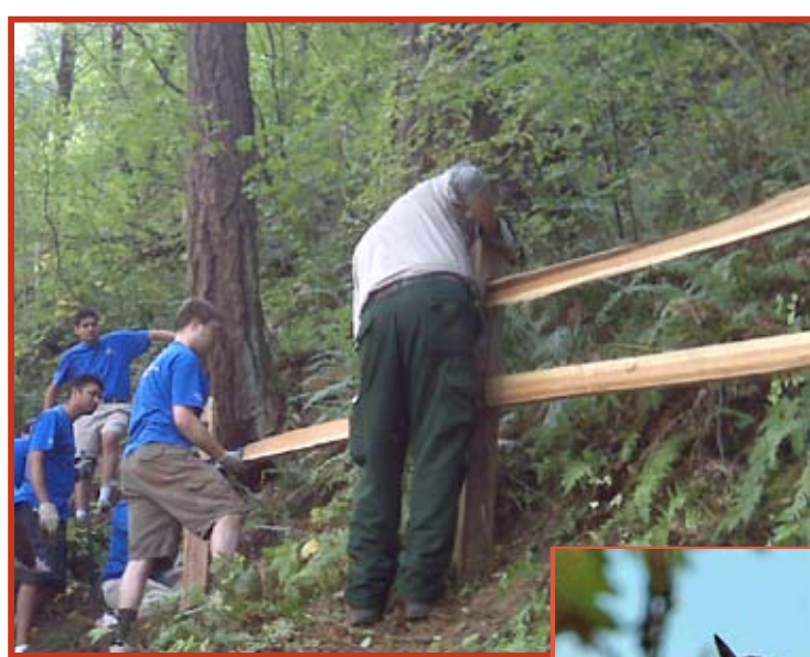
Volunteers building fencing along the Multnomah Falls switchback.

The Intel volunteers had a great time, and many plan to bring friends and family out to see their accomplishments. To learn how you or your company can volunteer in the Gorge with Friends, contact Renee Tkach at renee@ gorgefriends.org or 503-241-3762 x103.