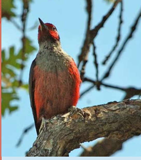
Lewis Woodpecker.