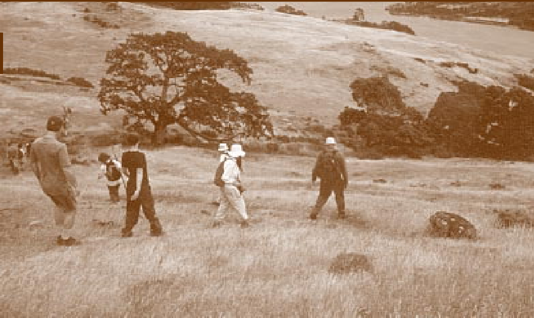
Hikers explore the dry fields of the Rowland Lake Labyrinth.