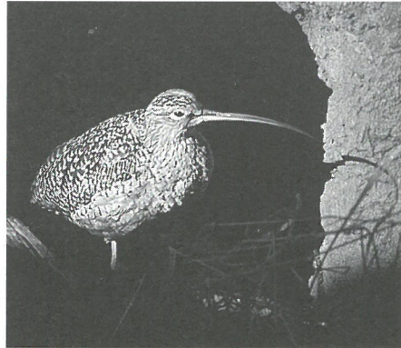
Long-billed Curlew, a Washington State monitor species, nest on the proposed 30-acre quarry site.

and shore birds, and is nesting habitat for Long-billed Curlew, a state monitor species in Washington. Spearfish Lake and the Columbia River may be impacted by the quarry, and Horsethief Lake State Park and the famous Native American pictograph "She Who Watches" is just a short distance to the east of the proposed 640-acre quarry pit.