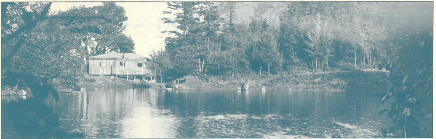
The little shop on the lake at Wyeth, 1917.