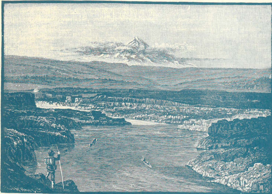
Columbia River Near The Dalles, unknown artist, from the Oregon Native Son magazine, July/August, 1900.