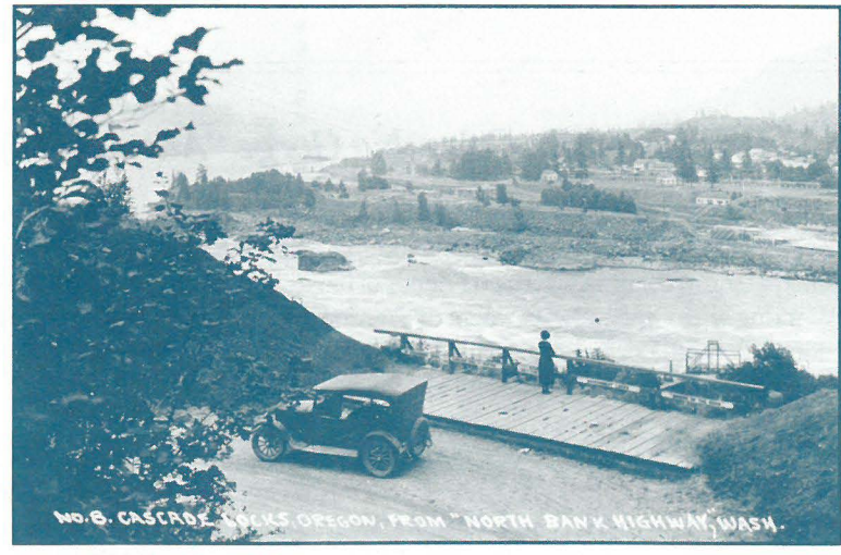
came to be that Cascade Locks from the "North Bank Highway".