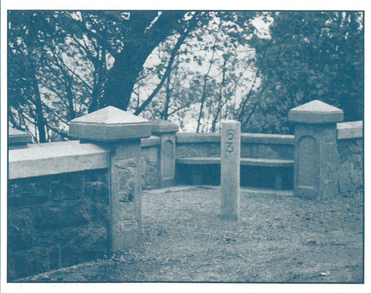
Transformed Ruthton Point.