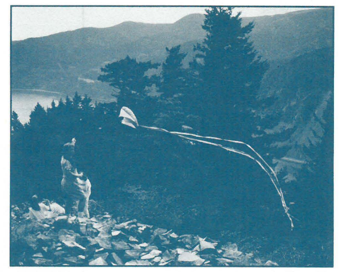
Atop Wind Mountain, Hiking Weekend 1992.

Looking ahead to 1993, the Thirteenth Annual Hiking Weekend will be June 19-20. Mark your calendar now!