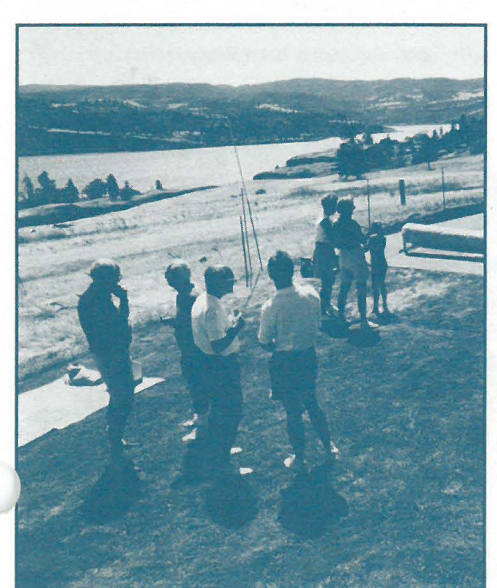
Summer Picnic 1992.

Founders of the Friends of the Columbia Gorge are the centerpiece of a feature article "You Own the Columbia River Gorge" in the September edition of <u>Town and Country</u> magazine. Check out a copy at your local newsstand.