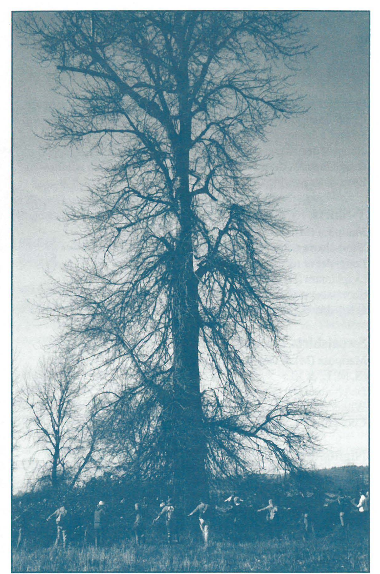
Lake Oswego Hikers encircle a giant cottonwood tree on the Sandy River flood plain.

Travel above the Sandy River, passing the first of these promised blackberries, and come to the construction area. Continue in the same direction you were heading and then veer back toward the Sandy River and pick up the path. Farther on, near its mouth, if you