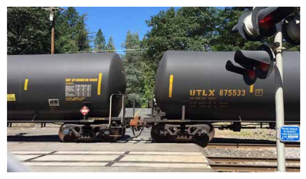
A stopped oil train blocking a local road in Skamania County.

Oregon still needs requirements for 24-hour notification of oil train schedules, periodic reporting on oil train traffic, and true worst-case-scenario planning and financial responsibility by the railroads, but HB 2209 is nonetheless a significant step. The Oregon Environmental Quality Commission must now draft rules to implement the legislation, and Friends will monitor the process to be sure the rules work to reduce and mitigate the threat that oil trains present in the Columbia River Gorge and Oregon communities.