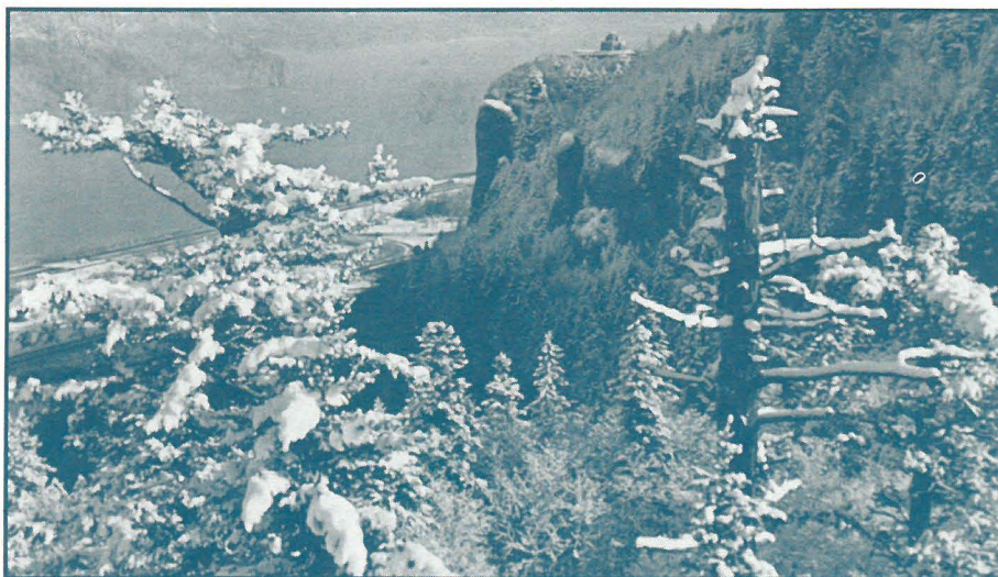
"Gorge in Winter"