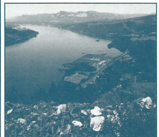
Hikers atop Wind Mountain.