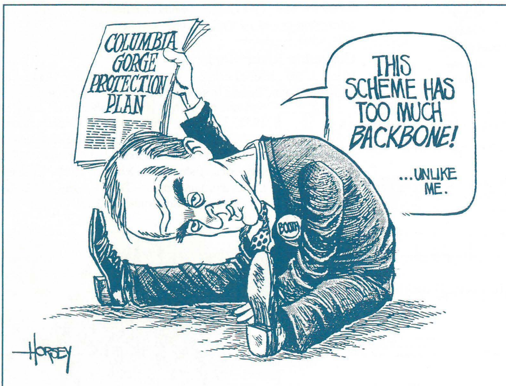
Seattle Post-Intelligencer, October 8, 1991.

The Gorge counties need his help. They need technical assistance for planning, they need funding for implementation, they need accurate information and support to move forward with this Management Plan. The Governor must be called upon to provide this assistance, to work to match private and public dollars to create a badly needed land trust, and to make appointments to the two open Gorge Commission seats that will match the strength and courage of his past appointees. It is time to get on with the job of protecting a global treasure and truly protecting local economic interest.