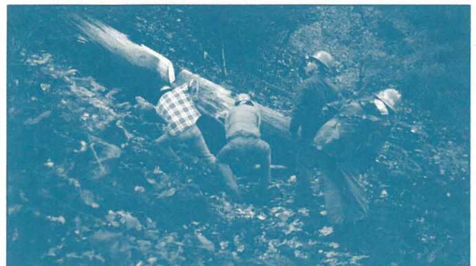
Forest Service staff and volunteers begin work on cleaning up the debris off trails in the fire area.

The Forest Service is working to develop short and long range trail restoration. This includes assessment of financial needs, the development of trail work projects, liability determinations, and the projects that can be done by volunteers. The Forest Service will work with Friends of the Columbia Gorge and Friends of Multnomah Falls to train and coordinate volunteers. Those individuals interested should call our office for more information, (503) 241-3762.