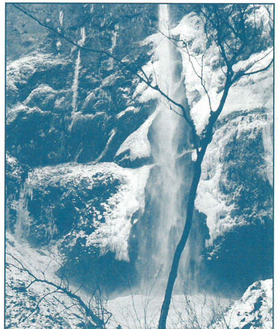
Multnomah Falls.