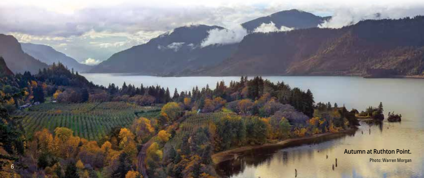
Autumn at Ruthton Point.

The Gorge Commission and the U.S. Forest Service will continue their review of Gorge protection rules through 2019 and the public will have many more opportunities to weigh in on Gorge protection priorities. Please sign up now to receive our action alerts at gorgefriends.org/subscribe . ■