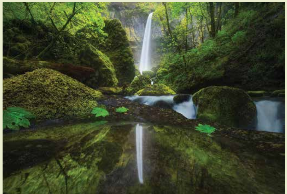
"Mirror," winner of Friends' 2017 Photo Contest, taken at Elowah Falls.