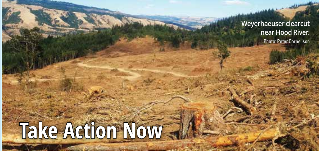
Weyerhaeuser clearcut near Hood River.