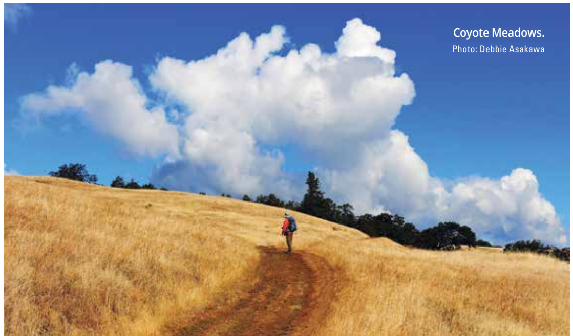
Coyote Meadows.