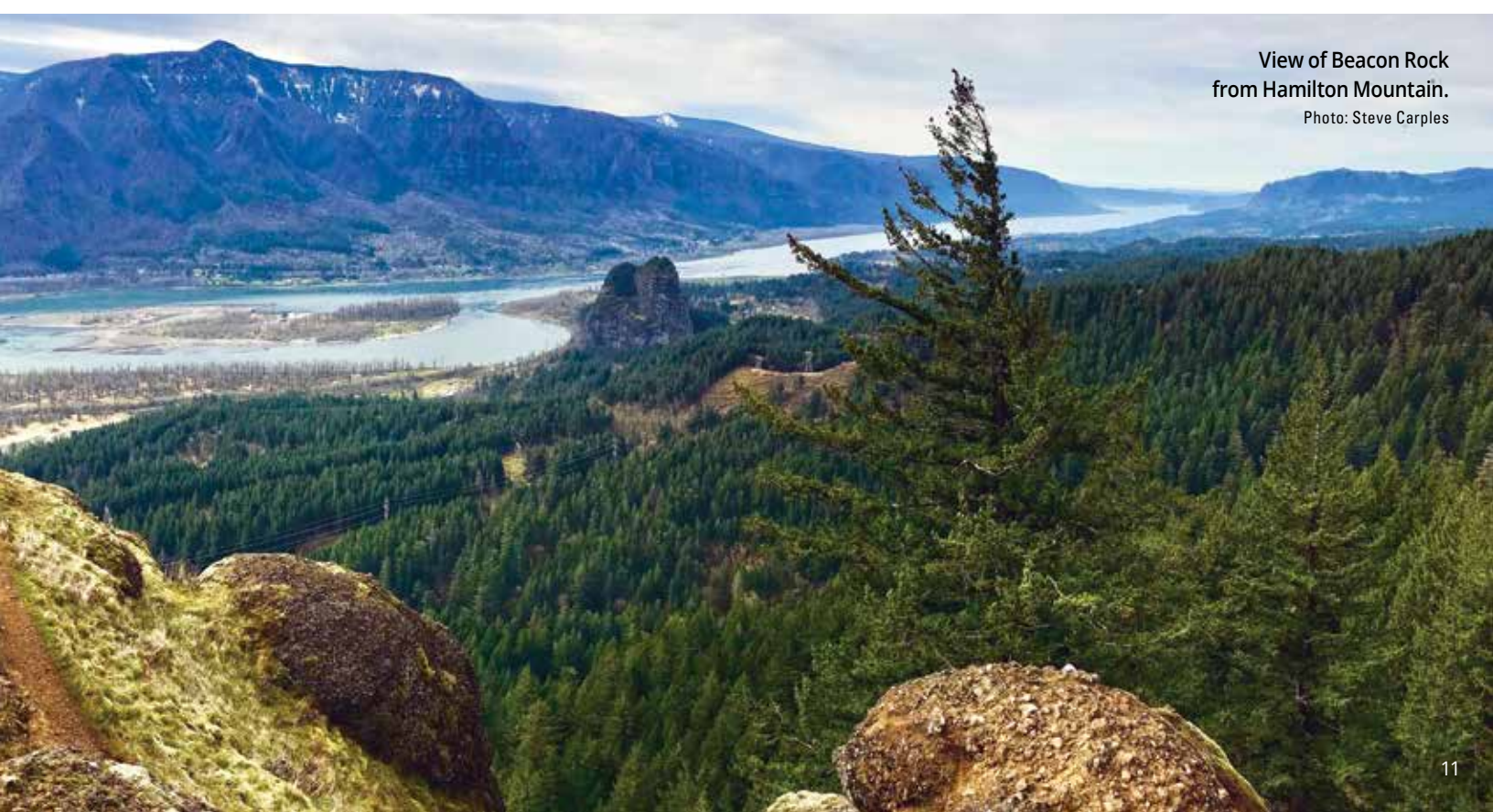
View of Beacon Rock from Hamilton Mountain.

Your donations today support our work to protect and steward the Gorge for coming generations. ■