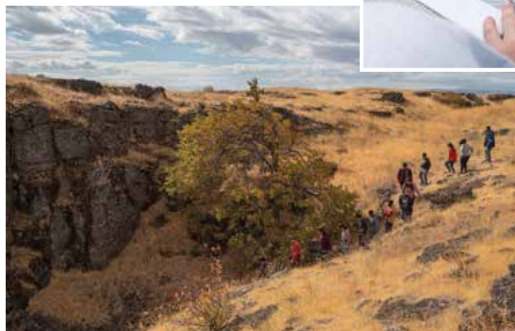
Left: Great Gorge Wahoo outing in 2018.