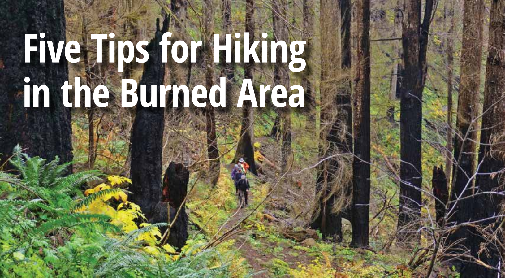
Hikers on the Multnomah-Wahkeena Falls trail.