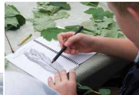
Above: An Explore the Gorge art project last spring.