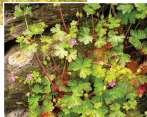
Invasive shiny geranium.

That's where boot brushes come in. Perhaps you've seen them at trailheads. They're not just for cleaning dirt off your shoes before you get in the car after your hike – although you should do that, too, so you don't bring home any weeds. But the boot brushes are also there so you can brush off any seeds you may have brought with you.