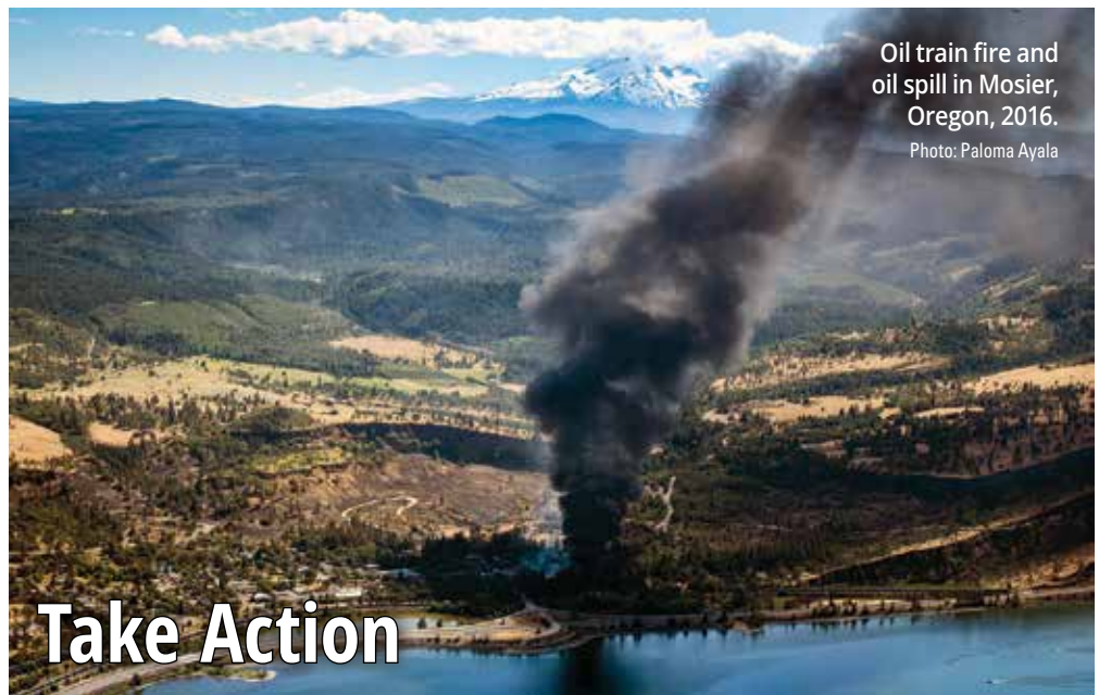
Oil train fire and oil spill in Mosier, Oregon, 2016.