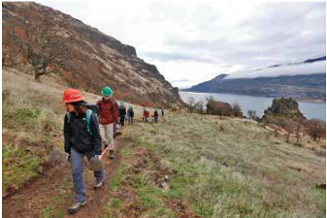
Trailwork volunteers at Lyle Cherry Orchard in December.

At first glance, the town of Lyle, Washington, might not bring to mind comparisons with places like Tuscany, Italy. But anyone who has spent any time in this charming small town knows that its rolling hills, stunning vistas of the Columbia River, and easy access to world-class wineries make this unassuming area a hidden treasure of the Gorge.