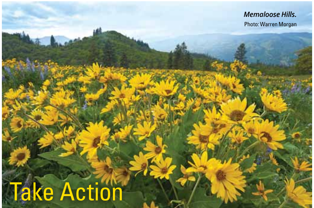
Memaloose Hills.