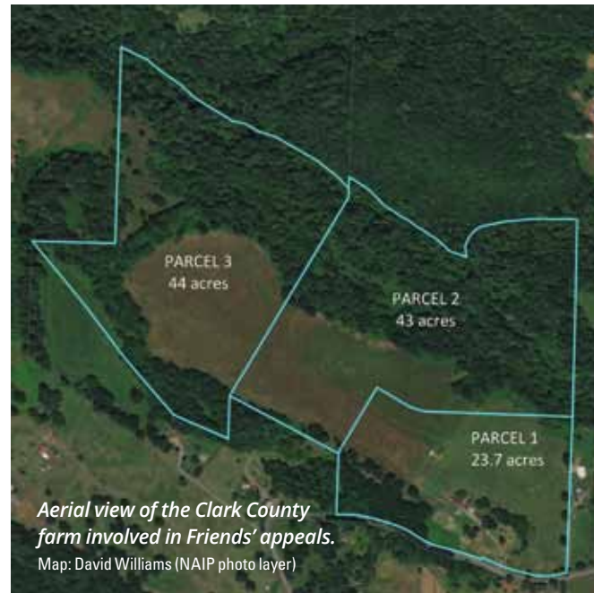
Aerial view of the Clark County farm involved in Friends' appeals.