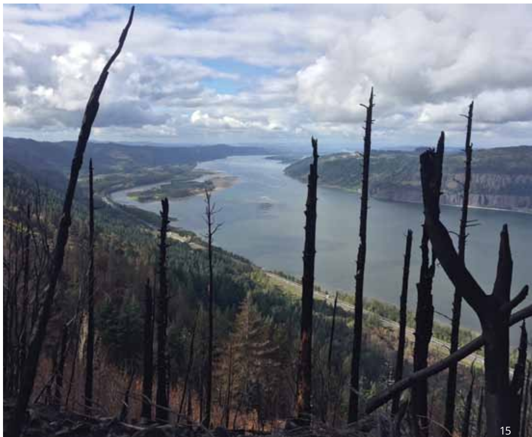
View from Angel's Rest trail in October, after the fire.

More than 1,000 people attended the Fire Forum series, and perspectives from DellaSala, Ellis, and Franklin were featured in related news coverage. The public’s passion for protecting the Gorge astonished even seasoned organizers, and the thirst for knowledge about post-fire recovery of the forest and trail systems made it clear that the commitment to protecting the Columbia Gorge will stay strong long after the Eagle Creek fire has finally burned out. ■