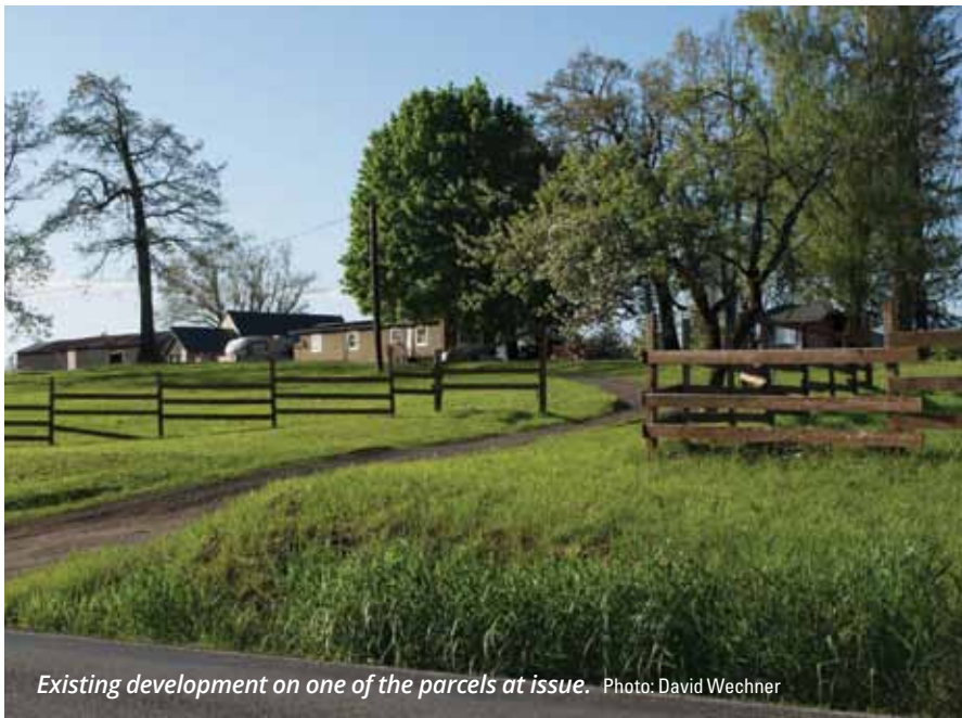
Existing development on one of the parcels at issue.