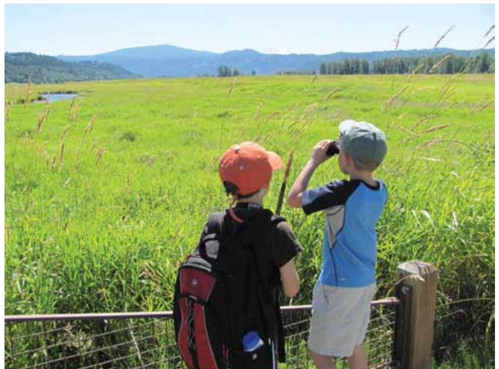
Young birders at Steigerwald National Wildlife Refuge.