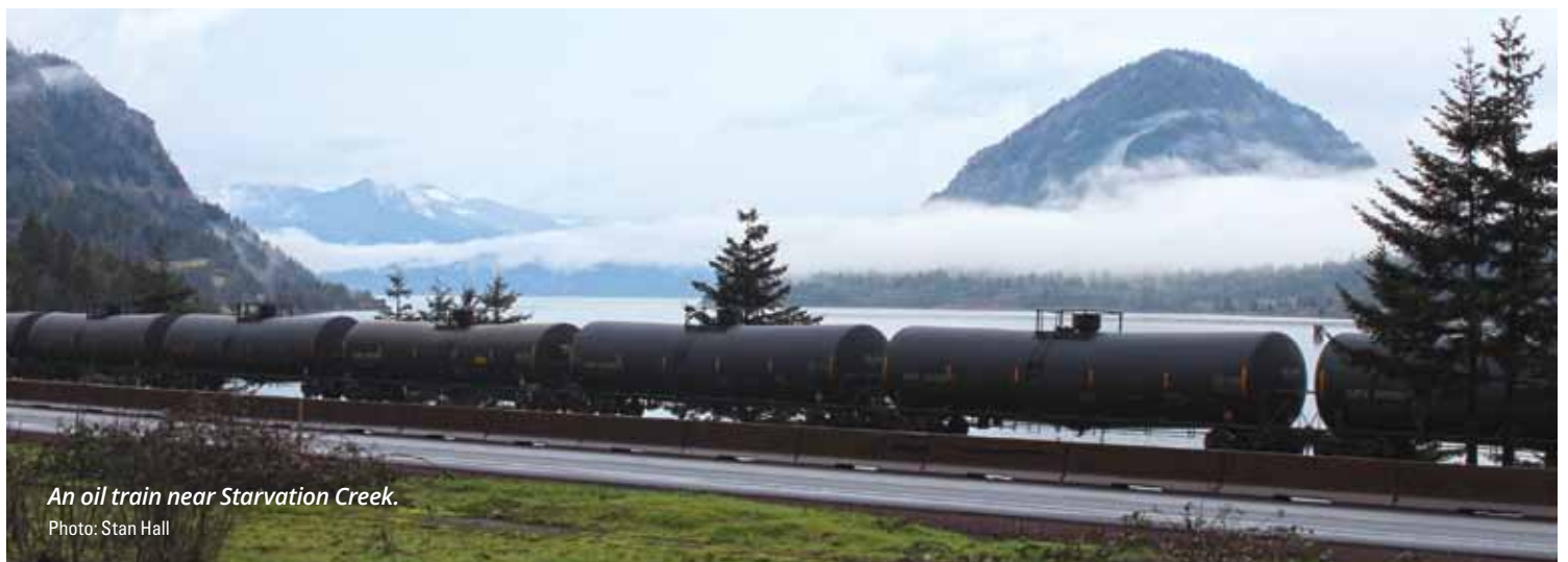
An oil train near Starvation Creek.

As Dr. Seuss said so aptly in The Lorax , “Unless someone like you cares an awful lot, it’s not going to get better. It’s not.” Together, we’re proving that we care an awful lot and it’s getting better – a whole lot better. ■